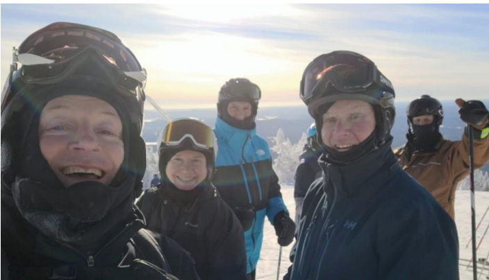
Jan. 19 – Tremblant bus trip

We also kept our popular “Fortune Fridays” event going – an informal weekly Friday meet-up at Camp Fortune for members, family, friends and for those just wanting to take a “Me Day” off work.