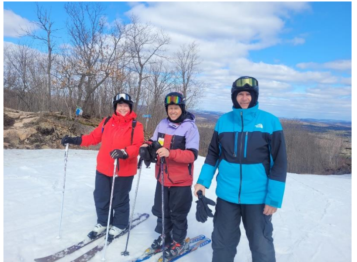
March 29 Camp Fortune – Final DH ski of the season