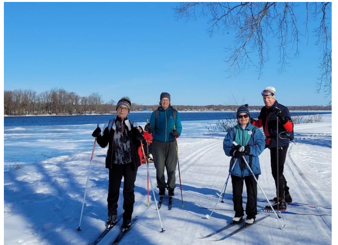
Feb. 6 – Ottawa Heritage East trail