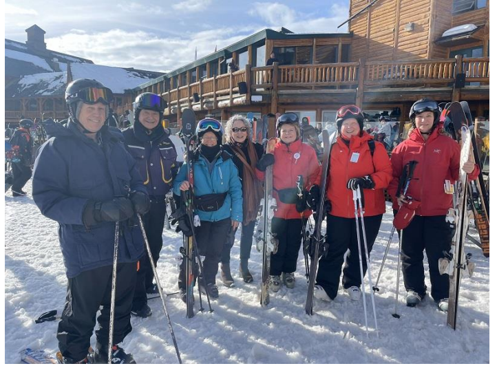
Feb. 2024 – Banff weeklong – Skiing at Lake Louise