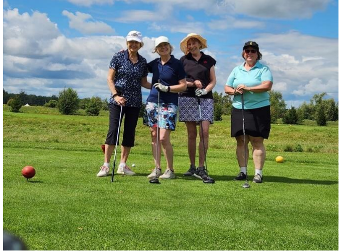
Aug. 12/23 – Golfing at Anderson Links