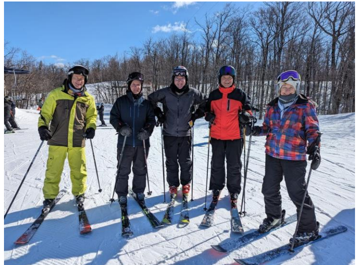
Feb. 21 – “Pop-up Ski” at Camp Fortune

While the pre-Christmas downhill schedule had to adjust to a late season start, our day trips afterwards made up for it.