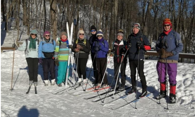
Jan. 20 – XC ski to Pink Lake

The cross-country ski day trips were supposed to start on December 16, and finally got underway on January 14. Eight of the 22 planned day trips went ahead (and one of those became a hike), with cancellations due to poor weather conditions or lack of snow. The group sizes ranged from 4 to 12 participants per outing. Our final official outing was on February 24.