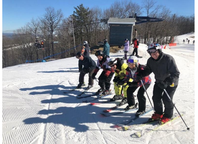
Mar. 8 – Camp Fortune

This was a win-win for both clubs, as the RA Ski Club helped fill their bus, and the Bytown Ski Club got to park their cars in the RA’s lot, as well as meet at the RA.