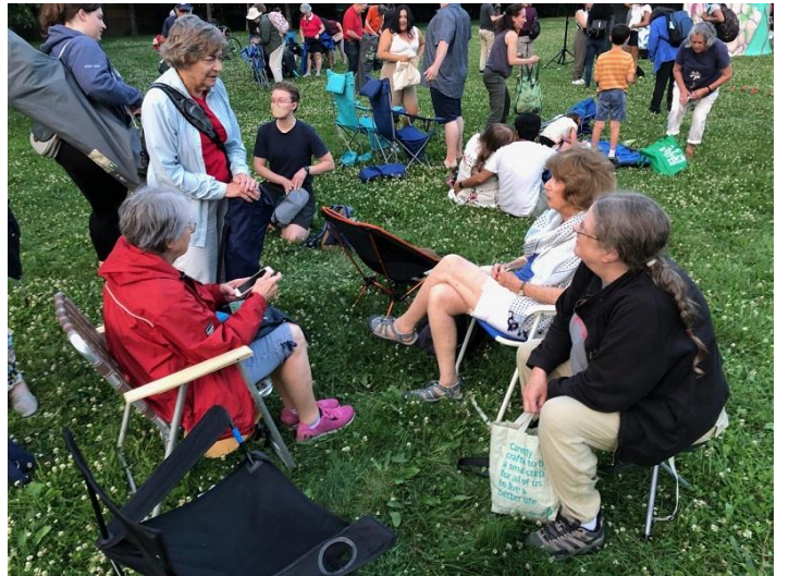
July 14/23 – Company of Fools “Hamlet”