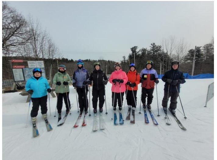
March 22 – Fortune Friday