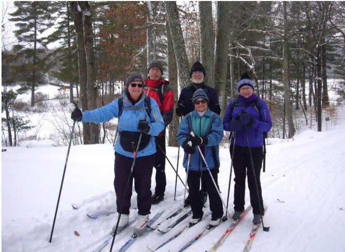
Jan. 14 – Taylor Lake ski

For next season, let us know your favorite routes, or trails that you have always wanted to try (including those outside of Gatineau Park and the city) and if you are willing to lead any day trips. Also, we would appreciate feedback about whether to meet up at the RA Centre to facilitate car-pooling, or to continue to meet at the trail heads.