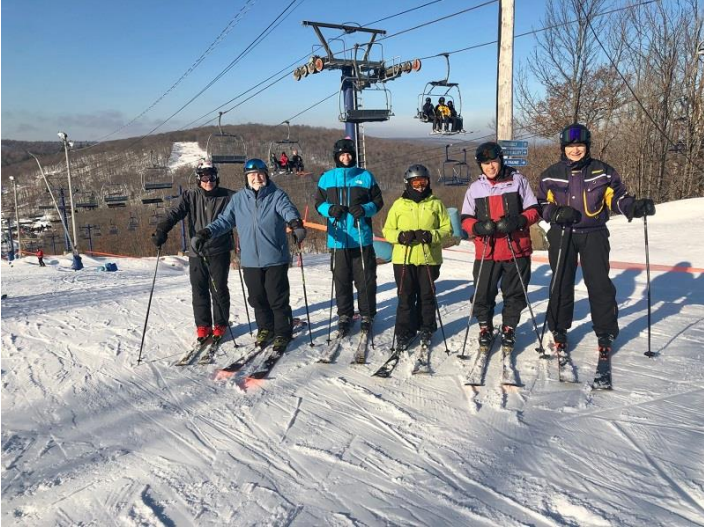
Dec. 15 Camp Fortune - First DH ski of the season

As I look out my window the first week of April, I see more snow on the ground than most of February & March !!