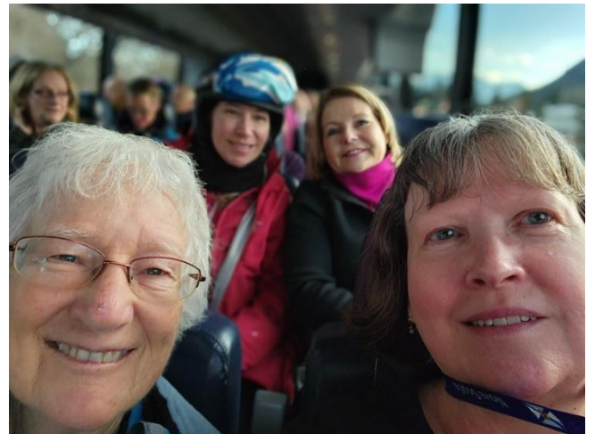
Feb. 2024 – Banff weeklong – On the bus