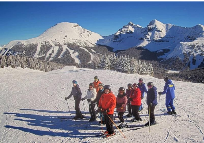
Feb. 2024 – Banff Weeklong – skiing at Sunshine