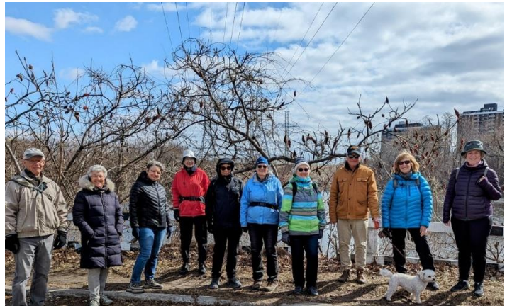
March 28 – Hike Ottawa East