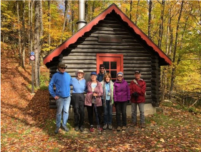
Oct. 12/23 – Hike to Shilly Shally cabin

Hello RA Ski Club Members! After a banner year of 34 hike and bike outings in 2023, the RA Ski Club is gearing up for another successful hike and bike outing season. My thanks to all our generous volunteer leaders who have stepped up to lead a hike or bike outing this spring...we couldn't provide these recreational opportunities to our members without your input. If you would like to lead a hike or bike outing over the summer or into the fall, please get in touch.