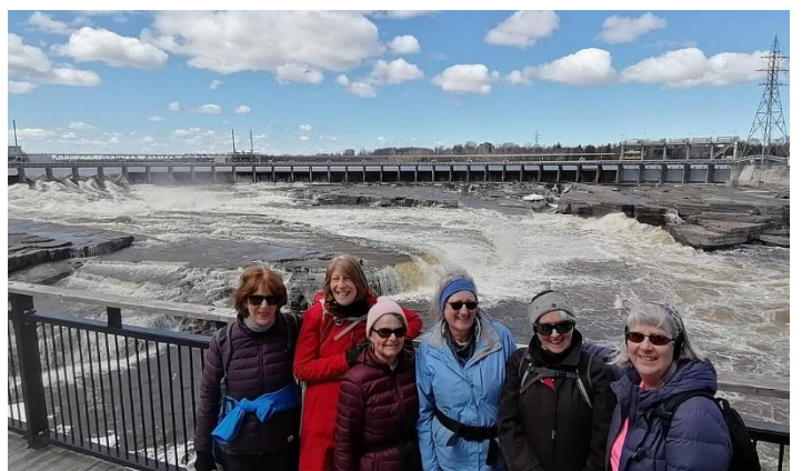
Apr. 6 – Hike to Chief Commanda Bridge