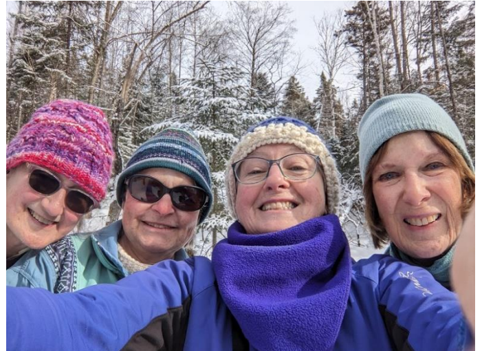
Feb. 14-16 – RA Skiers at Far Hills

Ski conditions were not very good and only a few of us put on our skis for, perhaps, shorter than usual skis. Most of us enjoyed fantastic walking conditions on some of the snowshoe trails where we were treated to great views and even a pileated woodpecker! No snowshoes were needed, but cleats worked well! A few people did head out to Le Petit Train du Nord and skied! A light snow on Thursday night did improve conditions on some of the trails.