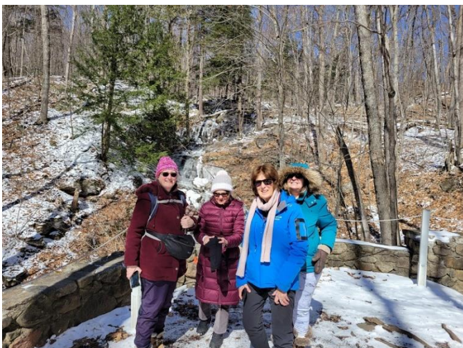
March 21 – Hike on Lauriault trail