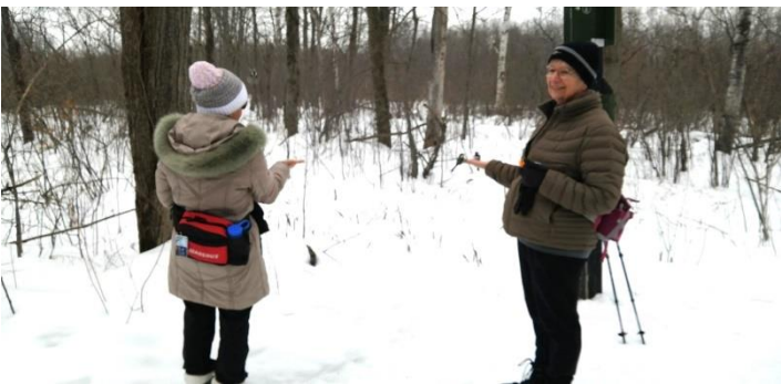
Jan. 31 – Hike at Mer Bleu