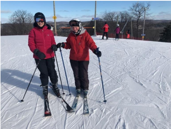
Feb. 14 - Edelweiss

While snow depth was a challenge on some runs, all ski hills were able to keep the ski season going right up to the last week of March, and our downhill club members enjoyed every day we went out with some of the best weather conditions in years.