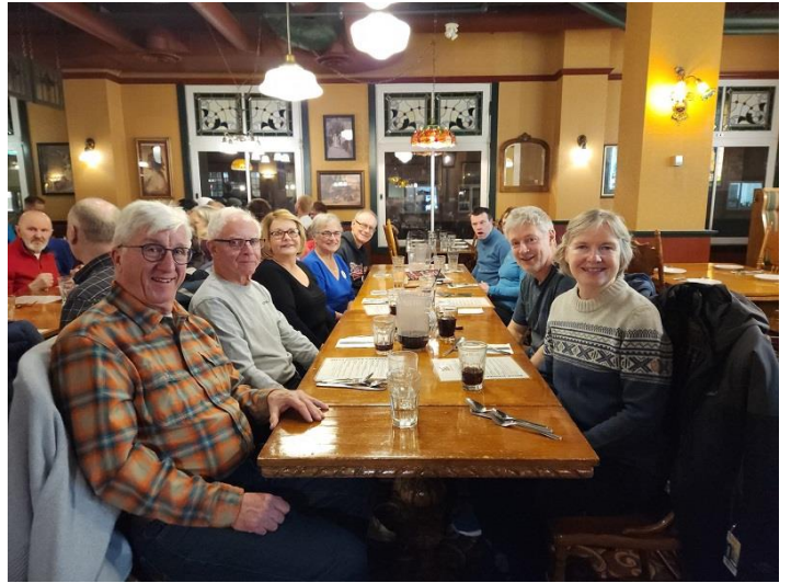
Feb. 2024 – Banff Weeklong