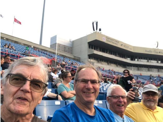
June 30/23 - Watching a baseball game