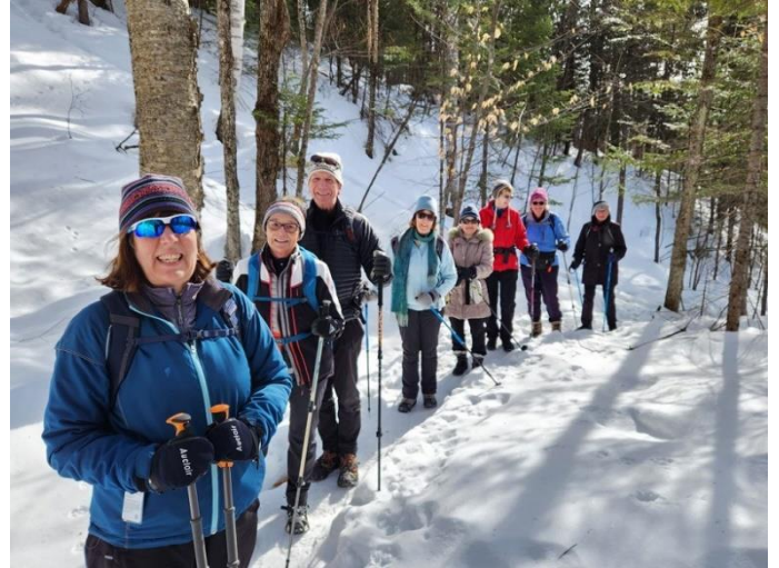
Feb. 14 – 16 – Hikers at Far Hills

RA skiers returned to Far Hills Inn this February 14-16 for a mid-week, multi-day trip. Twenty-five of us enjoyed each other’s company and some outdoor activities.