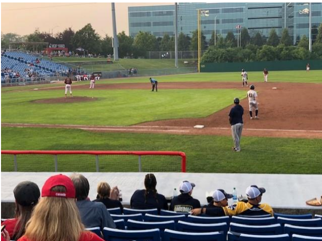
June 30/23 - Ottawa Titans baseball