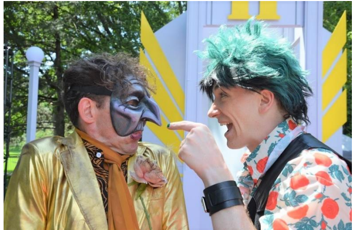
Aug. 2023 - Odyssey Theatre production “The Miser”