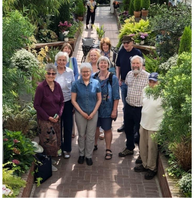
June 3/23 – Governor-General's residence & greenhouses