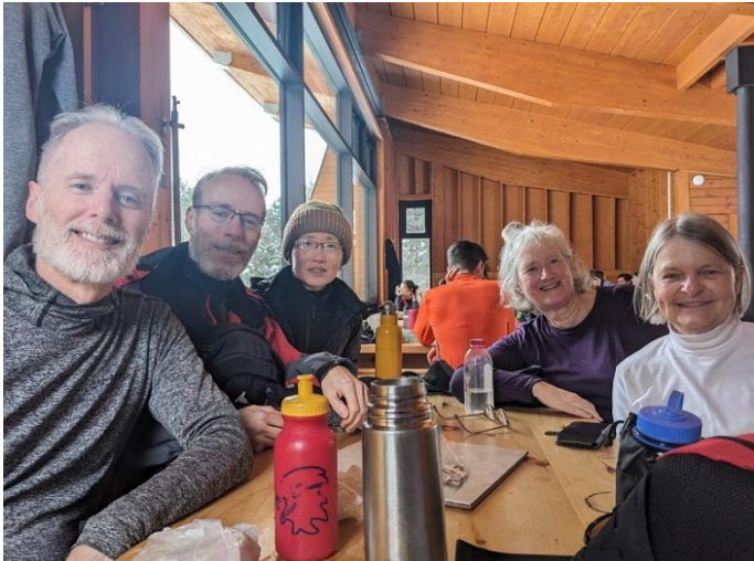
Jan. 14 – Taylor Lake ski, stop at Renaud cabin