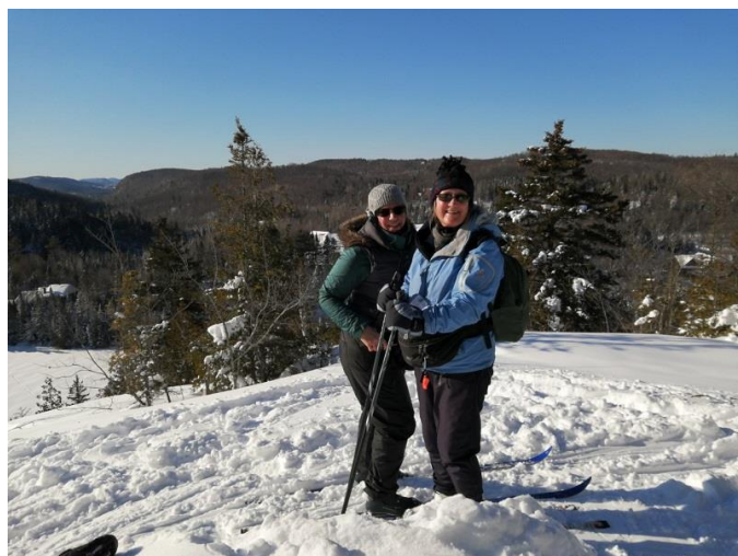
Feb. 2020 – Val David, Que.

The RA Ski Club is a member of the RA Centre – 2451 Riverside Drive, Ottawa K1H 7X7 - 733-5100 – www.racentre.com