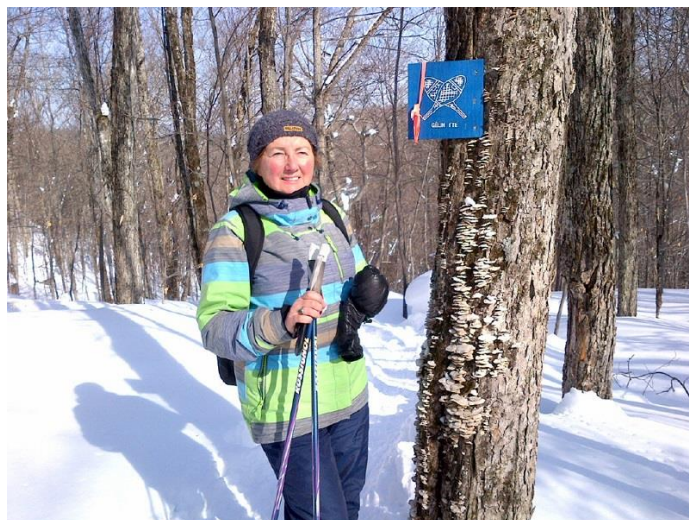
Feb. 2014 – Snowshoeing at Val David