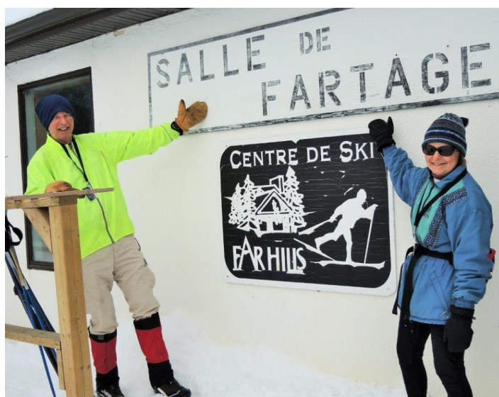
Feb. 2016 – Val David, Que.