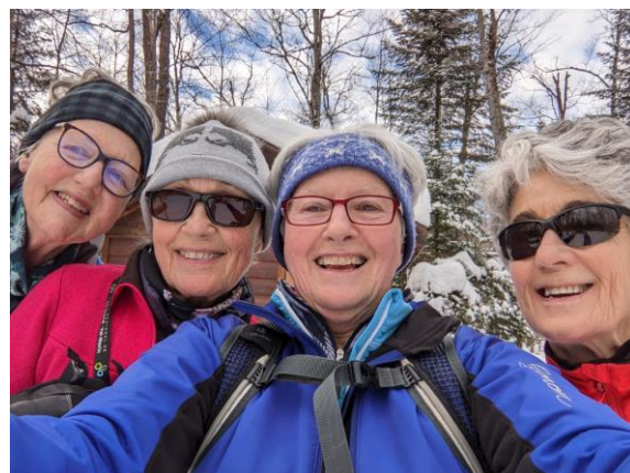
Feb. 2024 – RA skiers at Far Hills