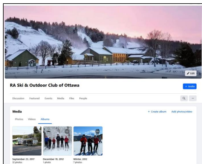
RA Ski Facebook page

Visit us on Facebook to learn about upcoming events, read members' comments, and much more! Go to RA Ski and Snowboard Club of Ottawa and ask to join.