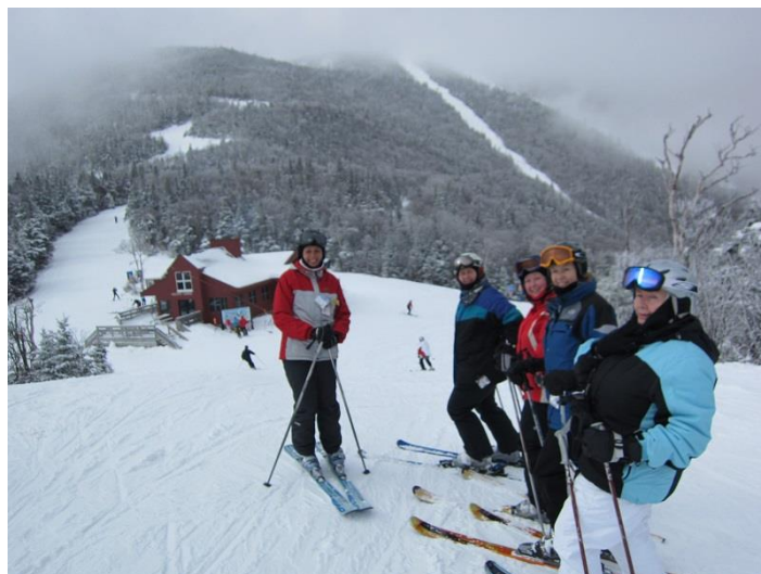
Mar. 2012 – Sugarbush, Vermont