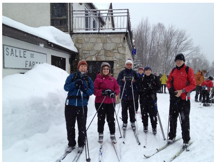
Jan. 2013 – Val David, Que.