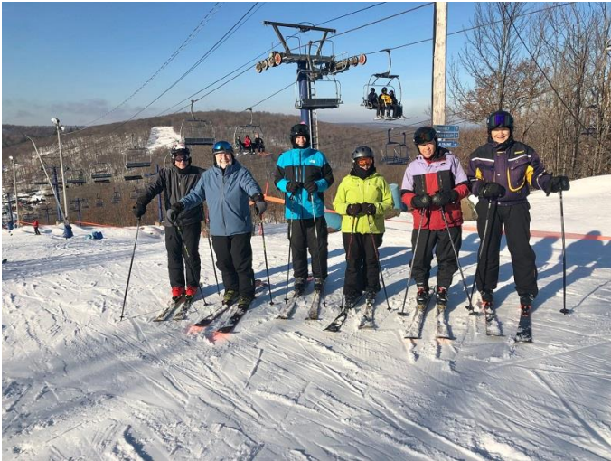
Dec. 16 – Fortune Friday, our first Downhill ski of the year

The Grinch took all our snow away for the Christmas holidays but snow is now on the way and all local hills are now 50%-100% open.