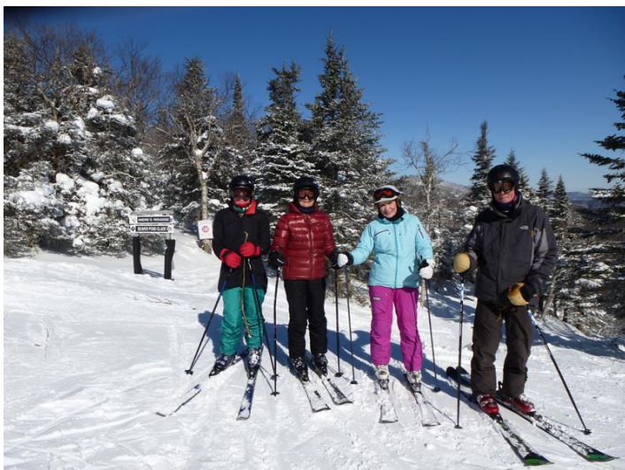
Mar. 2015 – Jay Peak