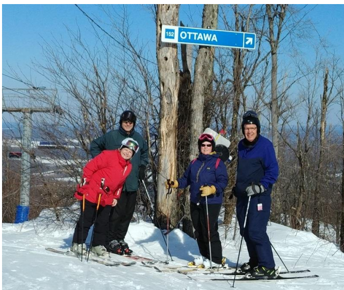
Feb. 2020 – Bromont, Que.