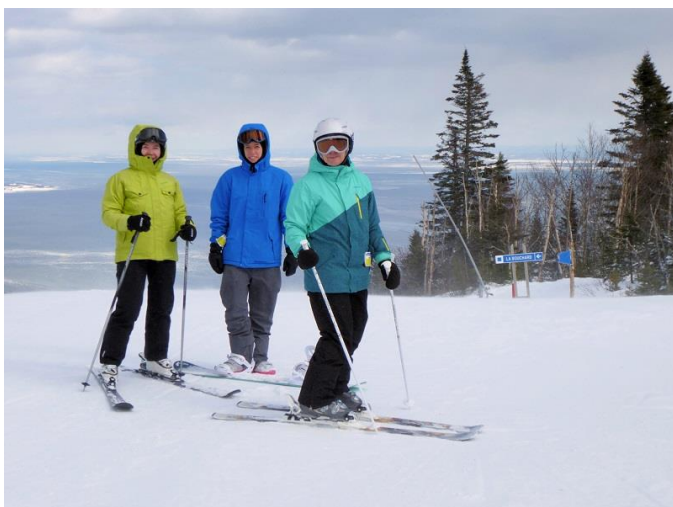
Feb. 2014 – Le Massif, Que.