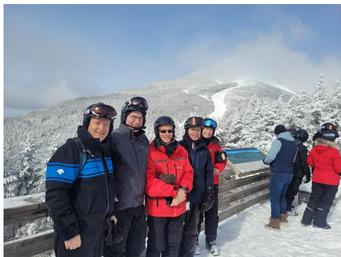
Feb. 2023 – Whiteface, NY