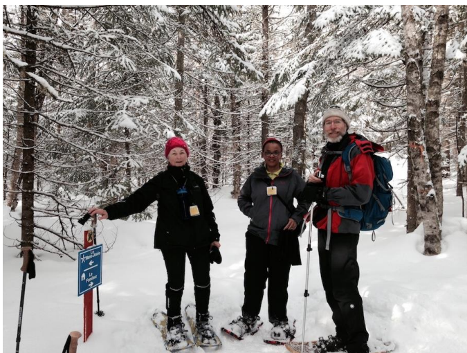
Feb. 2017 – Snowshoeing at Mont Ste-Anne