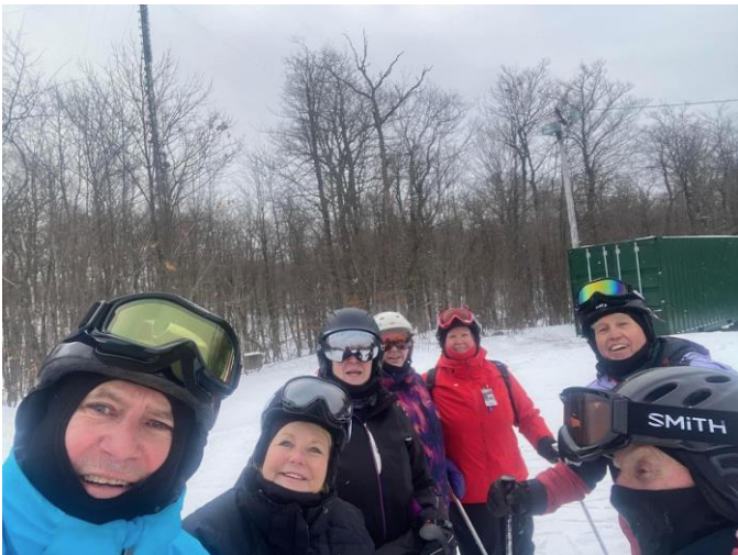
Jan. 5 – Fortune Friday

Our Fortune Fridays events – a weekly Friday ski day at Camp Fortune – always gets a good turnout and we managed to get 3 of those in before the Christmas break.