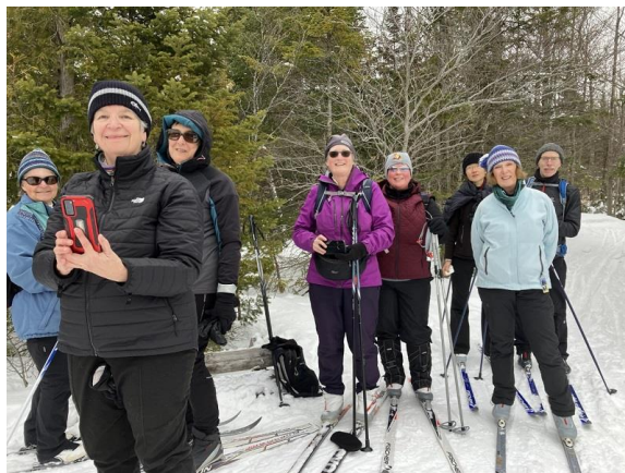
Feb. 2023 – Skiers at Far Hills

This trip sold out quickly and 26 participants are looking forward to skiing the trails at Far Hills again this year.