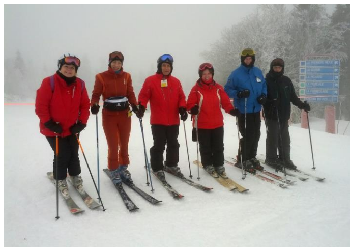
Feb. 2017 – Mont Ste-Anne, Que.