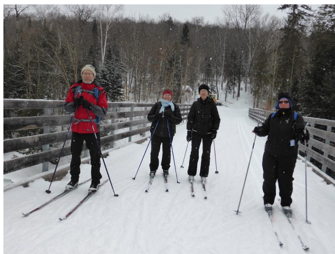
Feb. 2017 – Grand Lodge, Tremblant