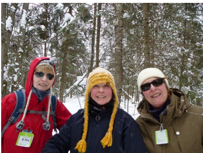
Feb. 2015 – Snowshoers at Tremblant