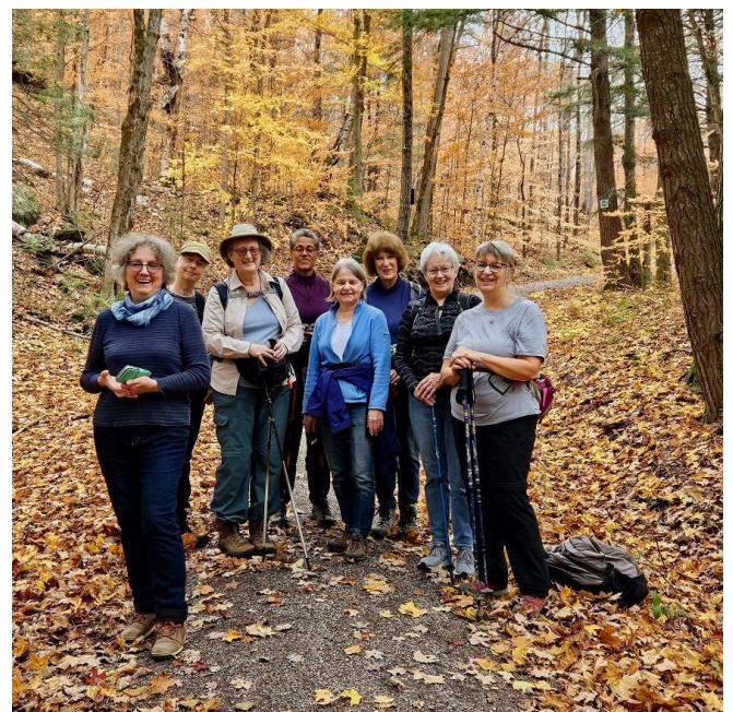
Oct. 26 – Hike to Lusk cabin