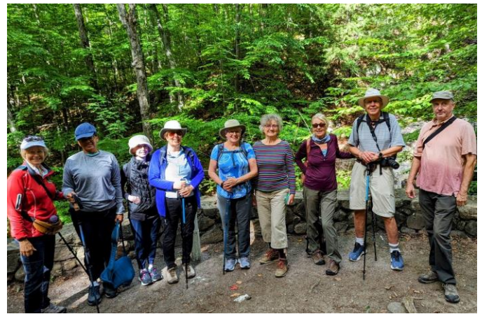
Sept. 16 – Hike, Lauriault trail