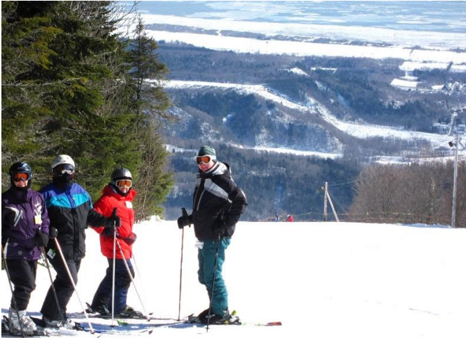
Feb. 2011 – RA skiers at Mont Sainte-Anne

We are also offering a multi-day trip to Mont Sainte-Anne, February. 25-March 1.