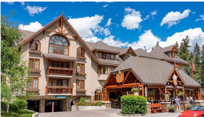
Banff Caribou Lodge

RA Skiers and friends will enjoy 7 nights relaxing in their Superior hotel room at the Banff Caribou Lodge & Spa after days of skiing the distinctive resorts of the Big 3 in Banff - Banff Sunshine, Lake Louise Ski Resort and Mt Norquay. Start your day with the hot breakfast buffet included in this package. Registration closes on Dec 15. Hope to see you on the trails!