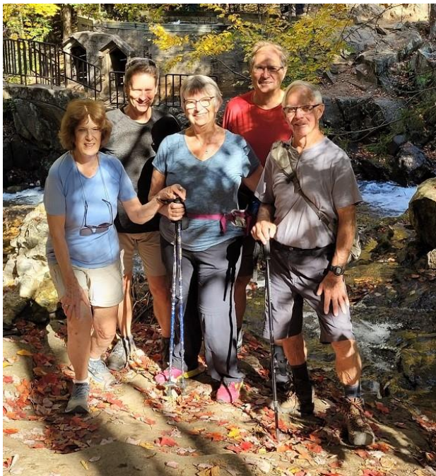
Oct. 4 – Hike to Carbide ruins