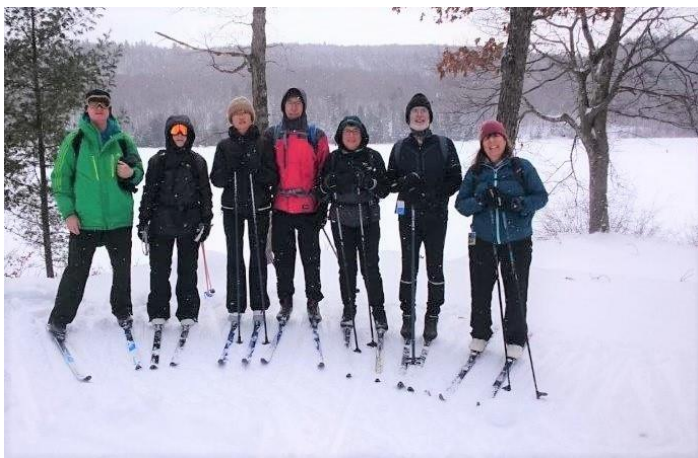
Dec. 26, 2022 – XC ski, Taylor Lake trail