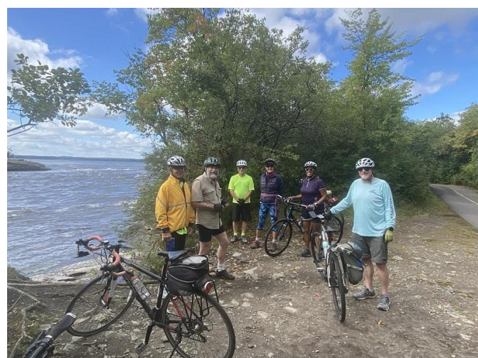
Sept. 13 – Biking to Aylmer Marina