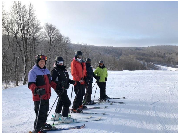
Dec. 20, 2022 – DH skiing at Camp Fortune