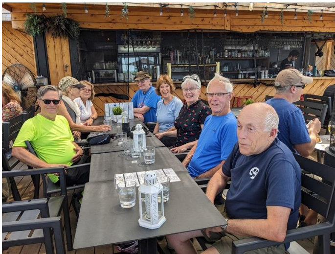
Aug. 10 – Biking to Rideau Falls, lunch at Tavern at the Falls