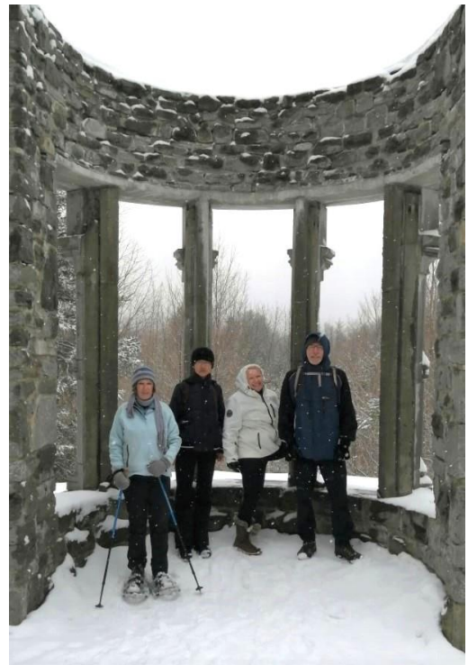
Mar. 16 – Biathlon (XC skiing and walking). At Mackenzie-King ruins

Thurs Mar 21 - 10:30 AM - Gatineau - P6 to King Mountain “Biathlon”