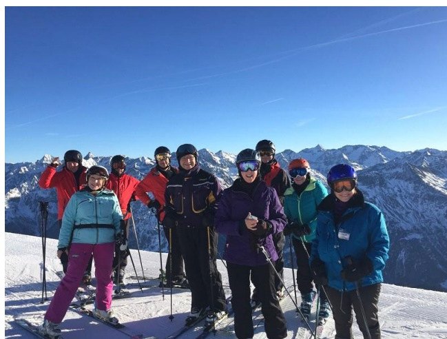
2017 Sölden, Austria