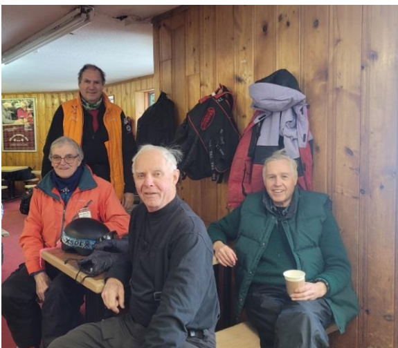
Jan. 25 – Meet’n’Ski at Edelweiss. Too cold to take the photo outdoors

Most hills last year moved to an online purchase system for day passes, and some savings for purchasing lift tickets in advance can be realized. However, we will continue to search for any promotions or savings that might arise throughout the ski season so that we can pass them on to you.