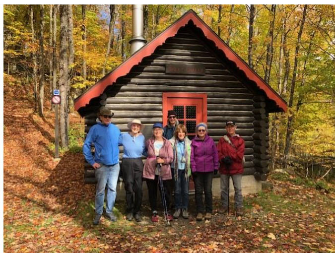
Oct. 12 – Hike to Shilly Shally cabin