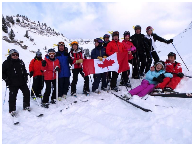
2015 Morzine, France