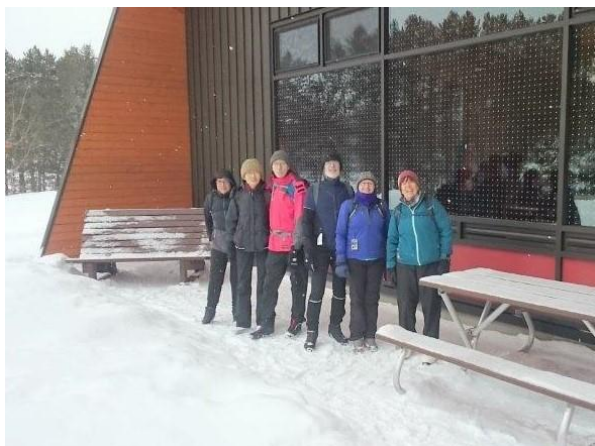
Dec. 26, 2022 – XC ski to Renaud cabin