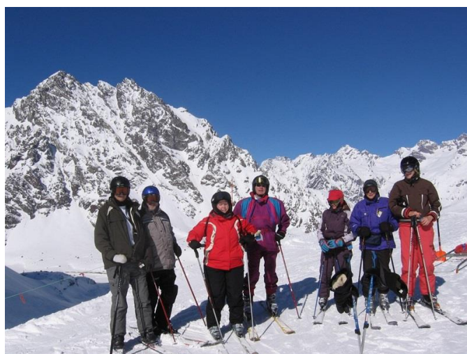
Aug. 2008 – Portillo, Chile