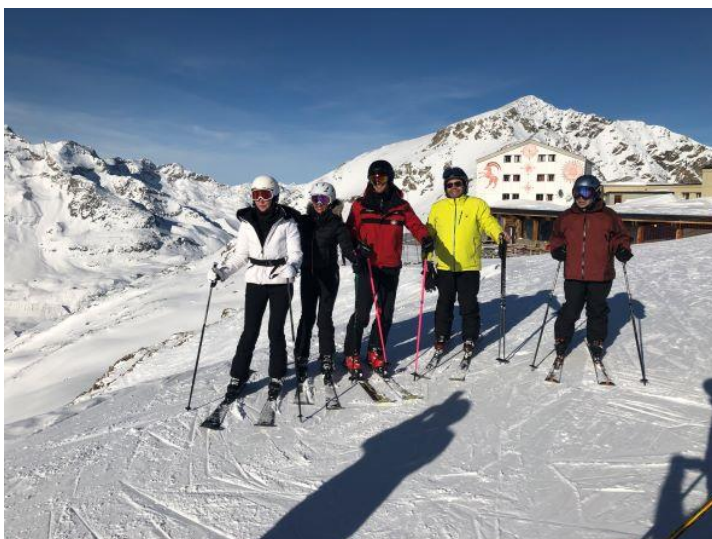
2020 – Saint Moritz, Switzerland