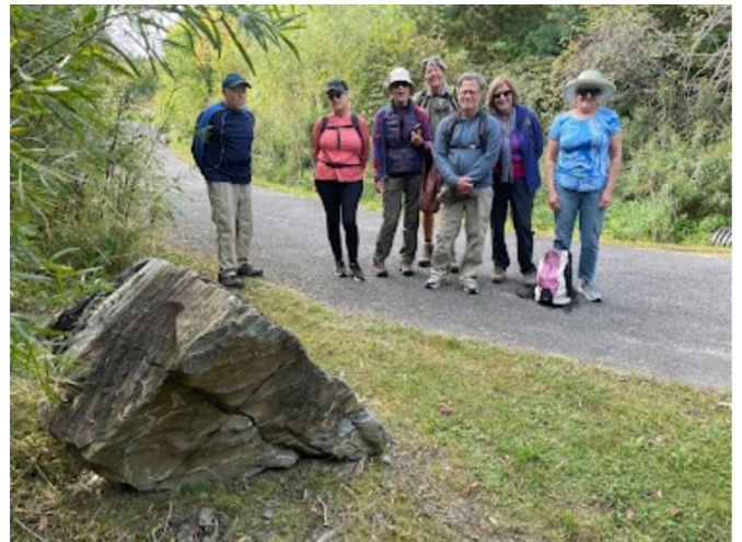
Sept. 27 – Poet's Pathway, Stage 4 – to Green Bean Café