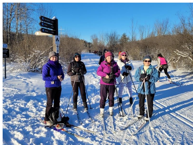
Jan. 15 – XC ski at Relais plein air