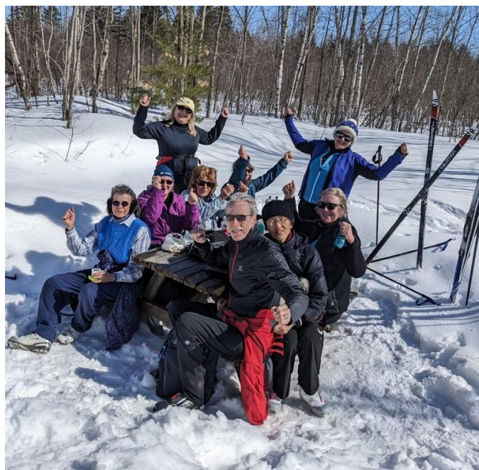
Mar. 6 – XC skiing at Larose Forest

We welcome skiers of all levels. Gatineau Park does have hills so our only requirement is that you be able to comfortably execute a snowplow stop, and a snowplow turn before joining us. Trails on the Ontario side are generally much flatter but there is the occasional small hill.