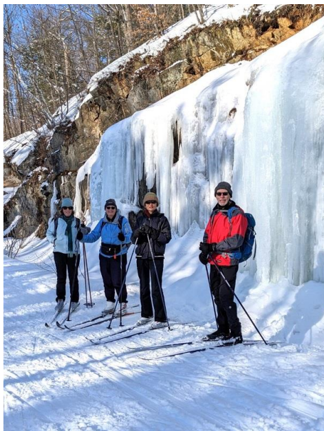
Feb. 26 – XC ski to Pink Lake

Make sure you lock your car in Quebec. Police check the parking lots and give you a ticket if your doors are unlocked or if your car's license plate is expired.