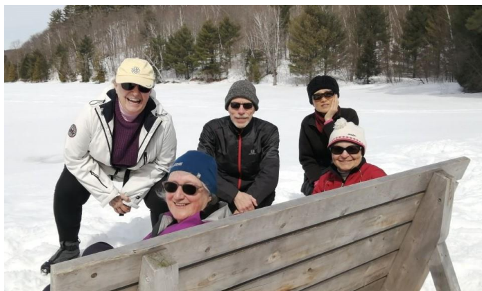
Mar. 12 – XC ski to the far end of Lac Philippe