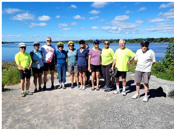
Sept. 9 – Biking to Petrie Island