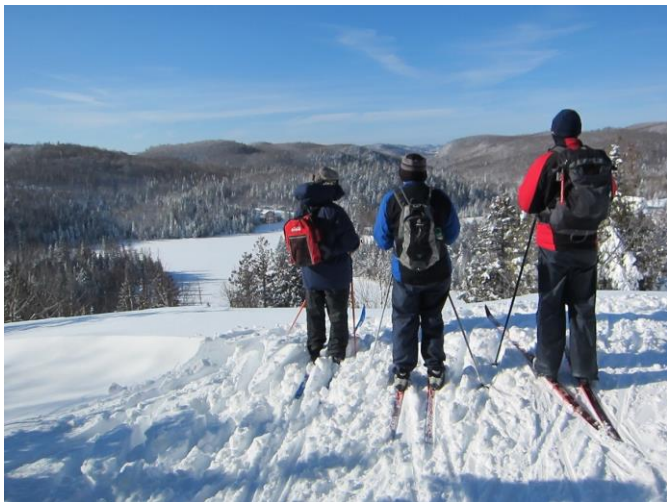
Far Hills viewpoint

The Parc regional Dufresne (formerly known as the Far Hills & Val-David XC ski areas) is one of the largest and most comprehensive ski centres in all of Quebec.