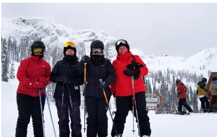
2022 – Fernie BC