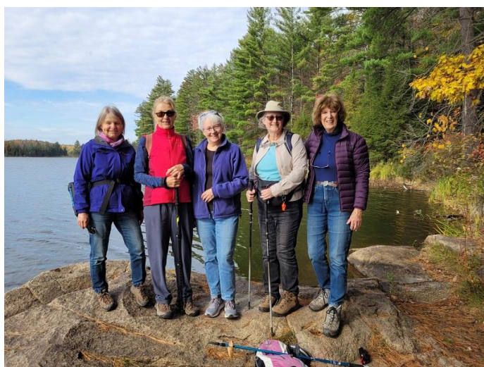
Oct. 19 – Hike to Brown's Lake