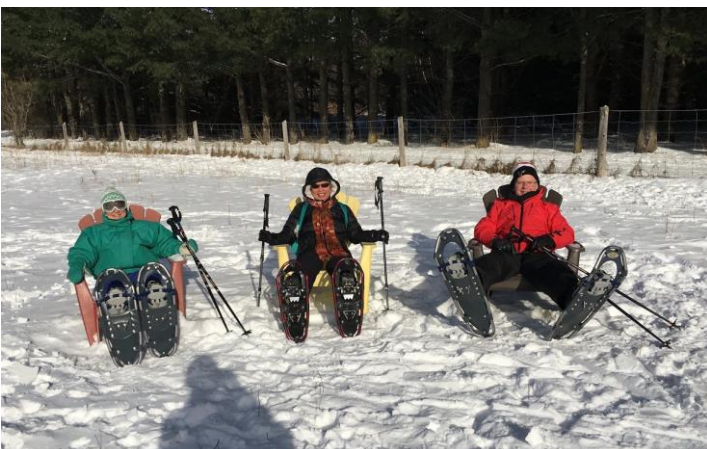
Nov. 23 – Snowshoeing at Bruce Pit