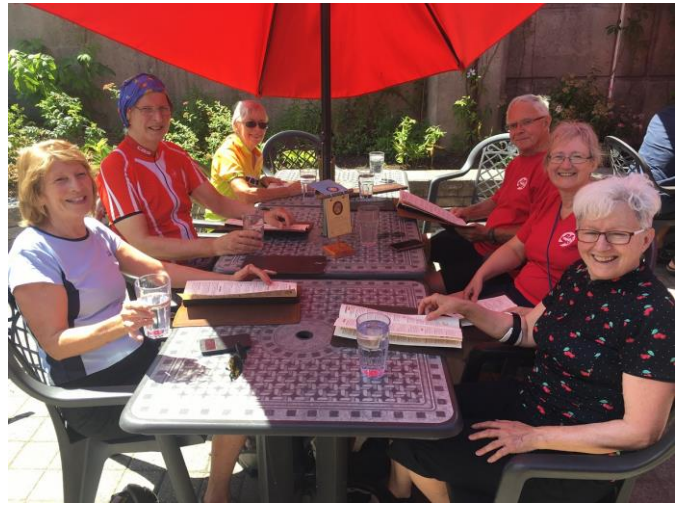
July 19 – Cycling to Les Brasseurs du Temps pub