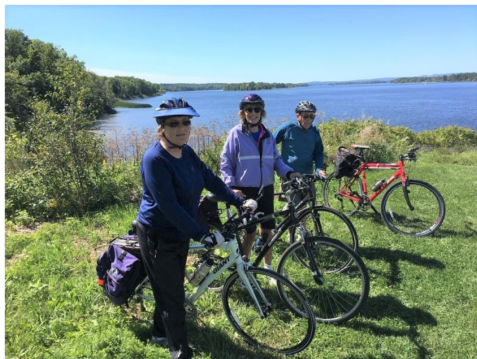
Sept. 8 – Cycling to Petrie Island

Park, to Aylmer where we happened upon an outdoor fair displaying electric cars and a friendly pub, and to Old Chelsea with a little hill-climbing. Then we had another lovely ride from Green's Creek to Petrie Island, where we watched fit fire-fighters compete in athletic events.