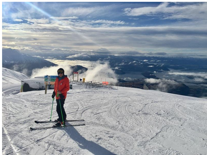
Skiing at Treble Cone, New Zealand