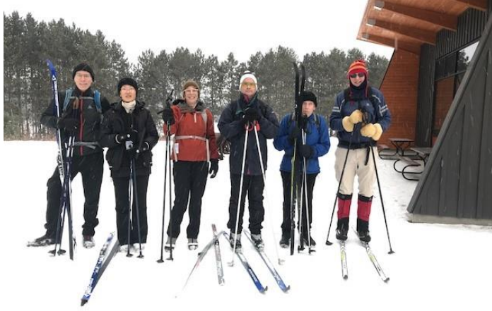
Dec. 15 – XC skiers at Renaud cabin

Our first official XC ski of the season occurred on Dec. 15 and we have had four Gatineau Park outings since then. For our 2018-19 season, we have a variety of outings planned this year. To see the trip schedule, go to www.raski.ca and, on the left side of the page, click "X-Country".