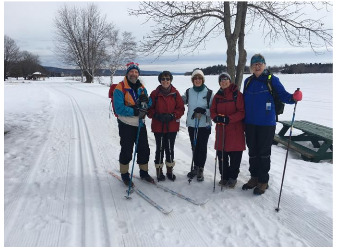
March 3 – XC skiing & hiking at Montebello