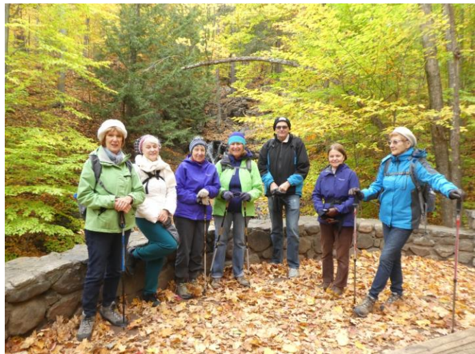
Oct. 17 – Hiking the Lauriault trail

In September, we had another easy hike around Mud Lake in Britannia Conservation Area, followed by more challenging Gatineau hikes to Carbide Mill, Lac Philippe to Lusk Lake, the Wolf Trail, and the Lauriault Trail.