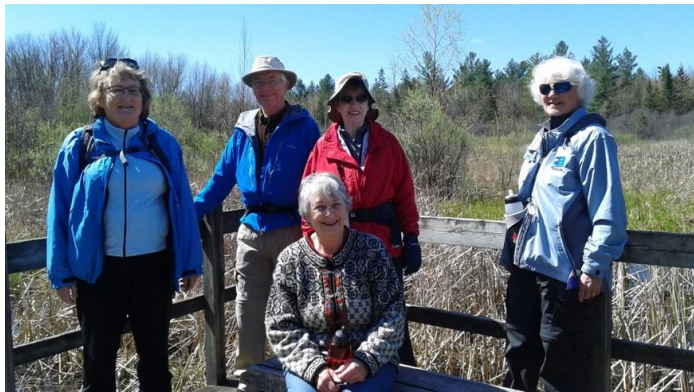
May 11- Hiking at Stoney Swamp

In the spring, we started off the year with an urban hike in Vanier, and an easy hike in Stony Swamp, where we saw a lot of birders and birds.