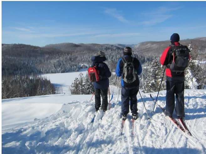
Mont Iceberg, Val David

There is still a bit of time to register on this weekend trip to the largest cross-country ski area in the Laurentians, with more than 100 km of groomed trails. There are also ample snowshoe trails in the same park and several downhill opportunities nearby.