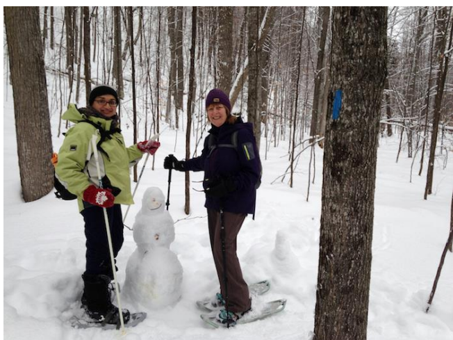
Jan. 2/16 Snowshoers and Frosty at Calabogie

All the planned outings are on the website and more may be added so keep checking the website and the SnowPhone for last minute changes. I look forward to snowshoeing with you!