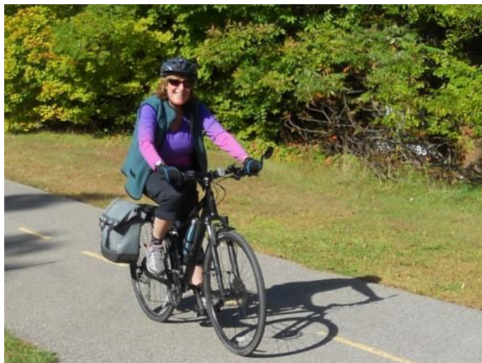
Sept. 30-31, Cycling at 1000 Islands

Our finale was a weekend overnight along the 1000 Islands bicycle pathway, where we stayed at Glen House Resort, and biked east on Saturday to Cornwall's Pub in lovely Rockport and points beyond, and west on Sunday to Gananoque, where we had a private guided tour of the Arthur Child Heritage Museum.