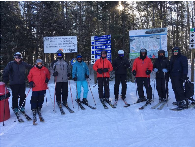
Jan. 15 – Bus trip to St-Sauveur