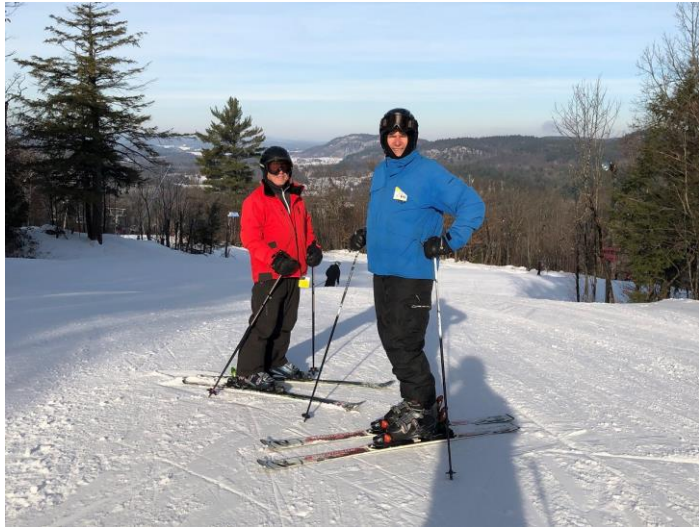
Dec. 15 – DH Meet'n'Ski at Edelweiss

As I write this on December 16th the RA Ski Club 2018/19 Downhill ski season has already begun with the first Meet n' Ski event having taken place yesterday at Edelweiss where the skiing conditions were as good as one can expect to have on any given day in January or February. By the time this newsletter has reached your inbox the ski season will be well under way. Will you have been? That's the whole point of being a ski club member, taking advantage of all the Downhill events arranged by your club executive, and skiing with friends. Sure we do it for ourselves but mainly we do it with you our members in mind. Let's call it an incentive to get us all out there because collectively we depend on everyone's involvement to make the club succeed.