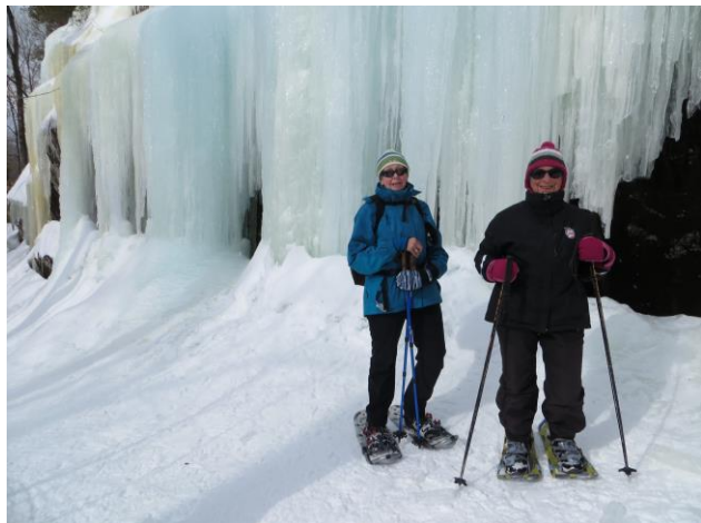
Feb. 2014 – Snowshoeing at Val David

Some are mid-week outings, there are several weekend ones to accommodate people who work during the week and some will be during our weekend to Val David. We have some to places we haven't done before such as Larose Forest and Morris Island near Fitzroy, both easy ones you are sure to enjoy. I may add more depending on weather conditions or if anyone wants to organize one, please let me know.