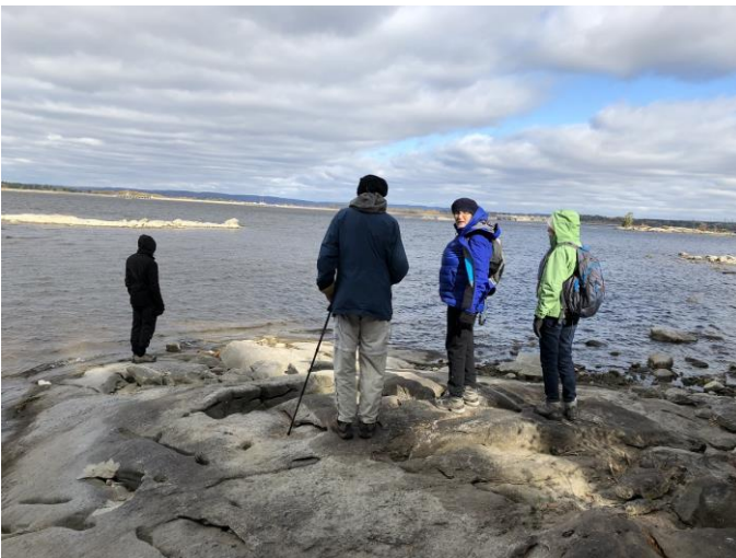
Oct. 25 – Hike at Morris Island