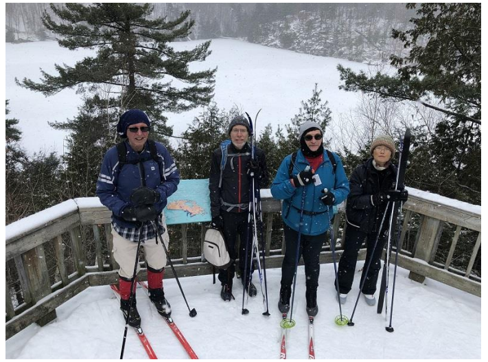
Dec. 26 – XC skiers at Pink Lake