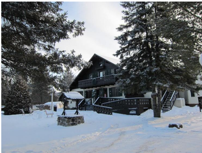
Auberge du Vieux Foyer

We'll be staying at the Auberge du Vieux Foyer, with direct access to the trails at Parc Dufresne.