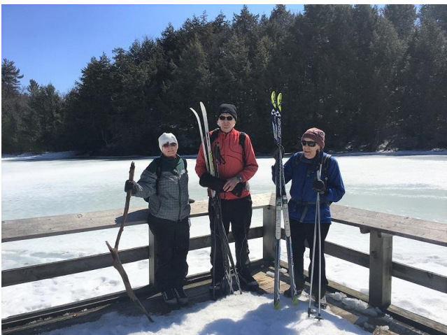
March 31: RA Ski Biathlon - Skiers at Mulvihill Lake

Most of our outings take place in Gatineau Park but we have planned many other destinations this year that will be of interest. Without compromising our ever-popular Gatineau Park day trips, we have included a number of Greenbelt/city ski outings. Most are shorter and easier routes.