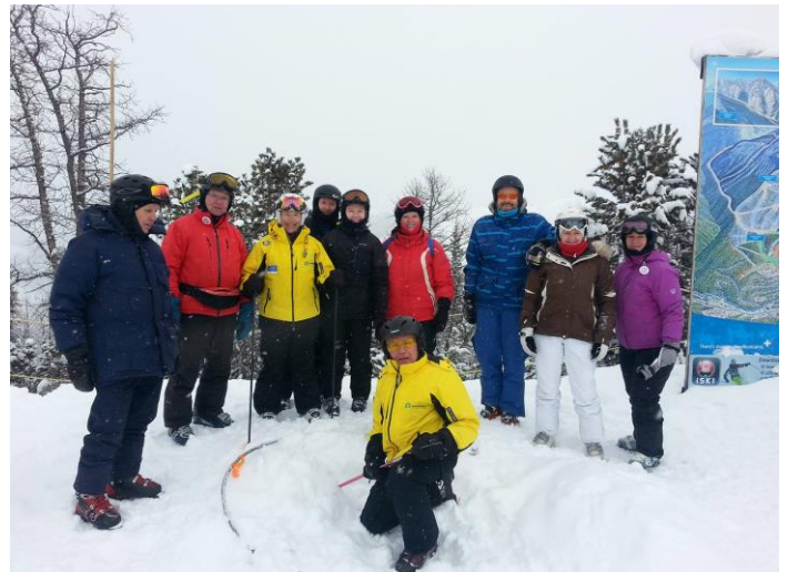
Jan. 27 – Feb. 3 – Weeklong to Panorama, BC