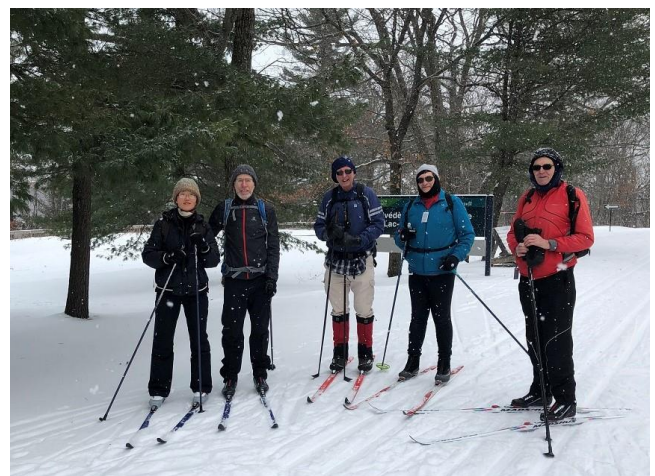
Dec. 26 – XC skiers at Pink Lake