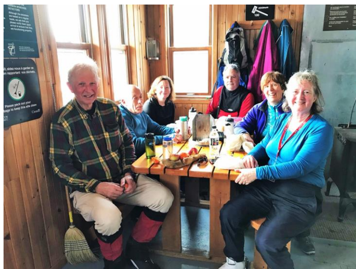
Jan. 3 – XC skiers relaxing at Lusk cabin