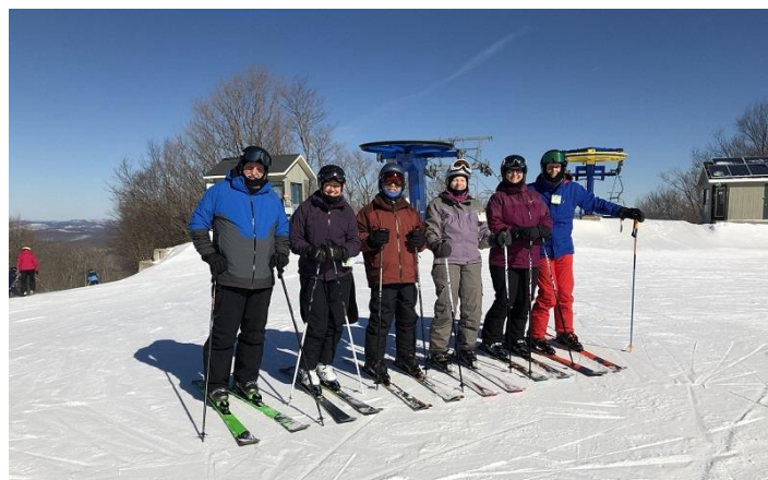
Mar. 18 – Tremblant DH bus trip - Mont Blanc skiers

In the event that we do not do a weekend trip next season, we could consider adding another day trip.