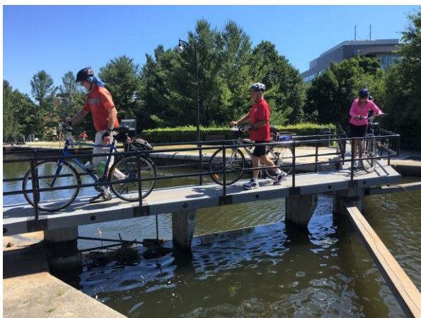
July 7 – Crossing Hartwell locks on the way to Mousette Park

We also put "RA Ski Photos of the Week" on our home page raski.ca .