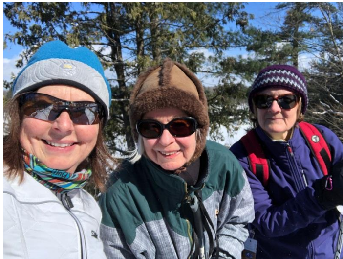
Mar. 6 – XC ski trip to Pink Lake