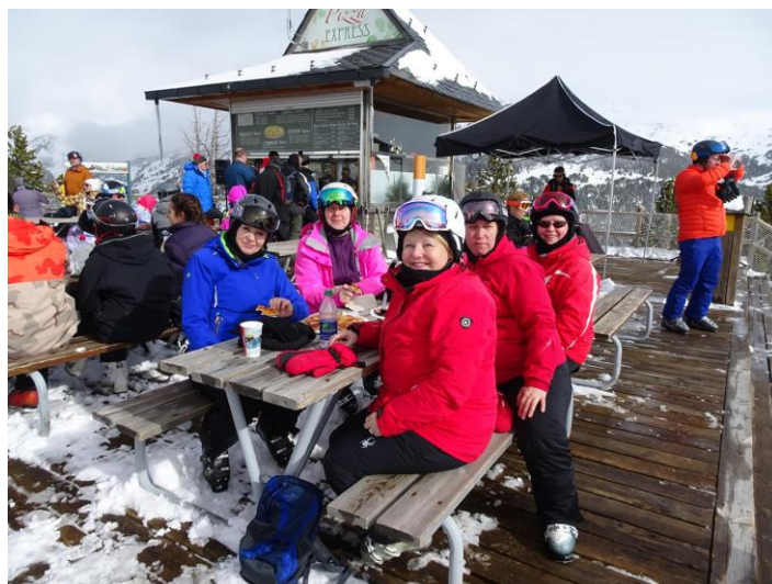
Jan. 2019 – Taking a break at Andorra