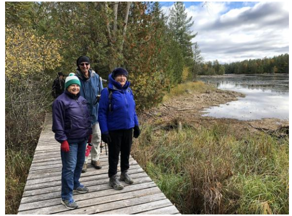
Oct. 25 – Morris Island

In 2018, we started the season in April with an urban hike around Vanier, followed by a Greenbelt hike in Stony Swamp. In September, we hiked around Mud Lake, Carbide Mill, Skyline, the Lauriault Trail, Morris Island, and Nepean Sportsplex. Sadly several Gatineau hikes were cancelled due to weather.