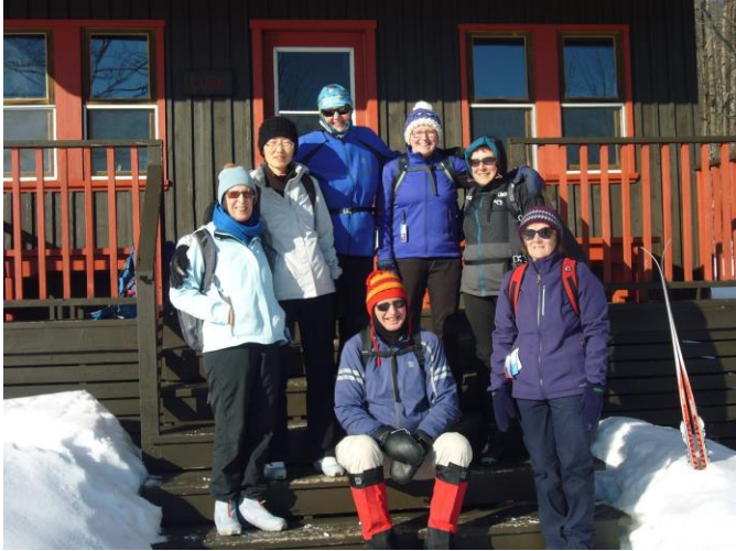
Feb. 10 – XC skiers at Lusk cabin