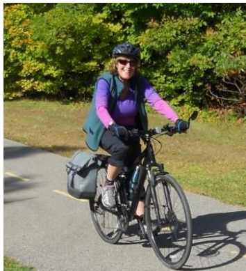
Cycling at 1000 Islands