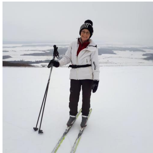
Jan. 15 – XC skier at Huron lookout