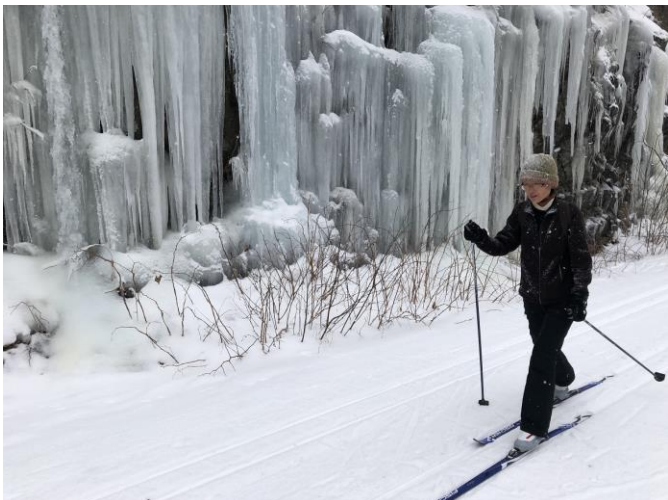
Dec. 26/18 - Waterfall on the trail from Pink Lake

Last but not least, a great big shout out of thanks to a wonderful team of trip leaders who made all these outings possible this season.