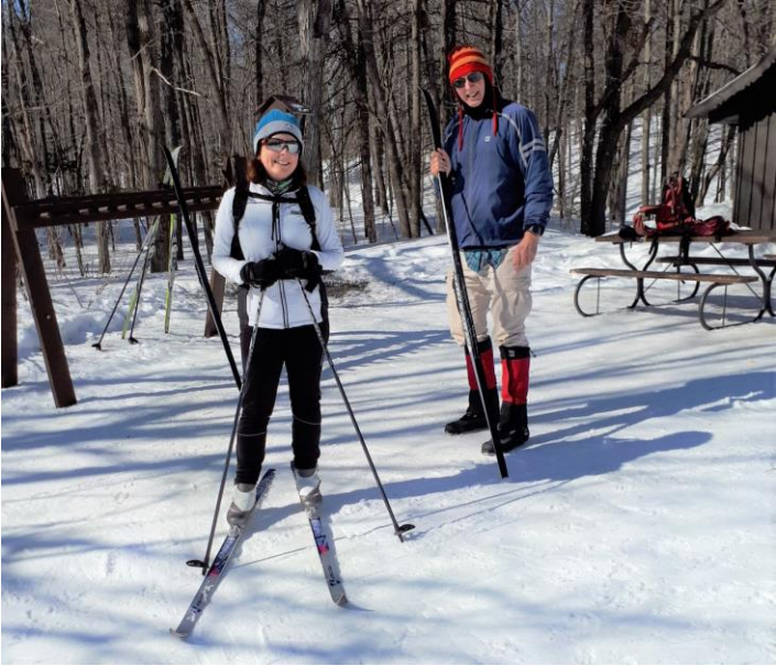
Feb. 28 – At Huron cabin