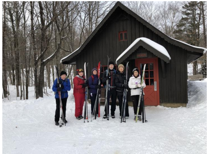
Jan. 13 – XC skiers at Huron cabin