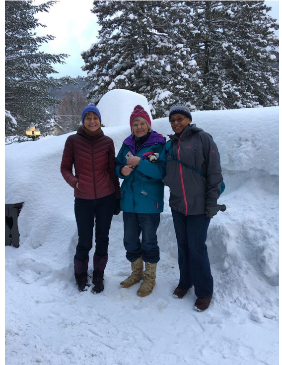
Val David snowshoers

The highlight of them all was the weekend we went to Val David. There was so much snow when we arrived and it continued to snow overnight. The next two days were beautiful sunny days, not too cold and perfect snow conditions.