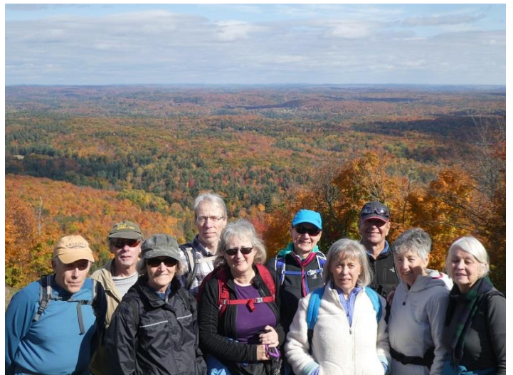
Oct. 14/18: Hiking the Skyline trail, view from Heggveit run