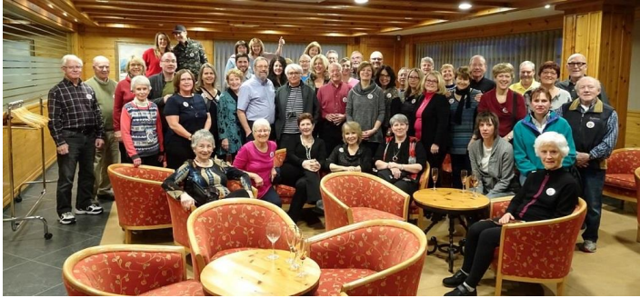
Hotel Nòrdic Welcome Reception

Despite a few hiccups along the way, RASkiers finally left Canada on January 25, on two sets of flights, to explore the previously unknown sectors of Granvalira in Andorra. Unfortunately for flight group 1, none of their skis plus a few suitcases and boot bags didn't land in Barcelona with the group. Eventually, all 49 participants arrived in El Tarter and regrouped in the dining room of the 4-star Hotel Nòrdic for a late meal. Shortly before midnight, the rest of the baggage (save one lonely boot bag) also checked-in and reunited with their owners in the morning, just in time for our first day on the slopes. Ideally located, after our buffet breakfast, we walked out of the hotel ski locker and onto the lift (or skied to the gondola) to start our exploration of the six sectors of the largest ski resort in the Pyrenees.