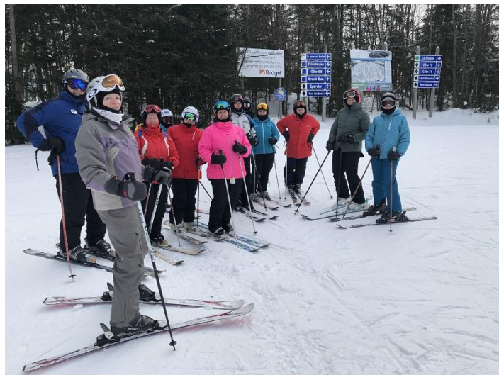
Jan. 14 – DH bus trip to St-Sauveur