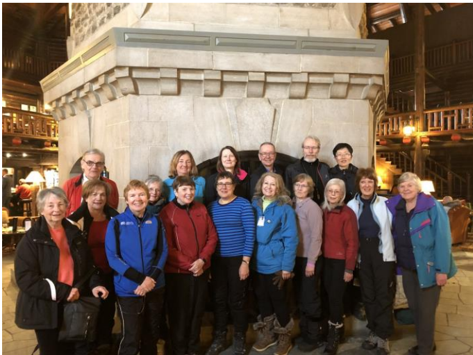
Mar. 2 – XC & snowshoe trip to Montebello

We had an excellent record turnout for our Montebello day trip in early March. There were 18 members who came out to ski, snowshoe, walk and dog sled on the grounds of the Chateau Montebello followed by lunch in the chateau restaurant.