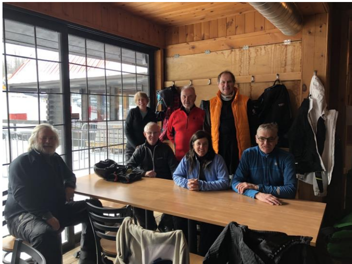
Jan. 10 – Meet'n'Ski at Cascades. Too cold to take a photo outside!