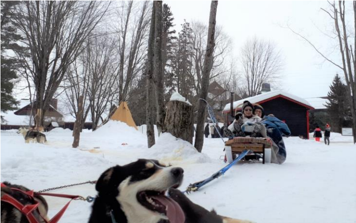
Mar. 2 – Dog sledding at Montebello