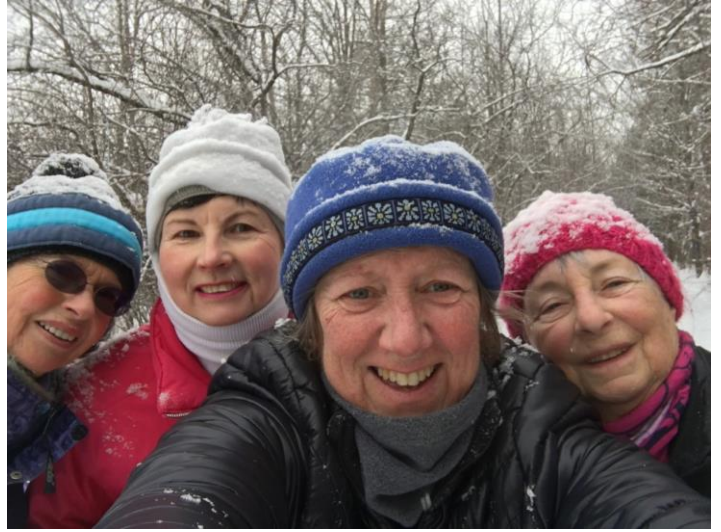
Jan. 23 – Snowshoers on the Jack Pine trail