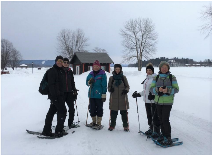
Mar. 2 – Snowshoeing at Montebello