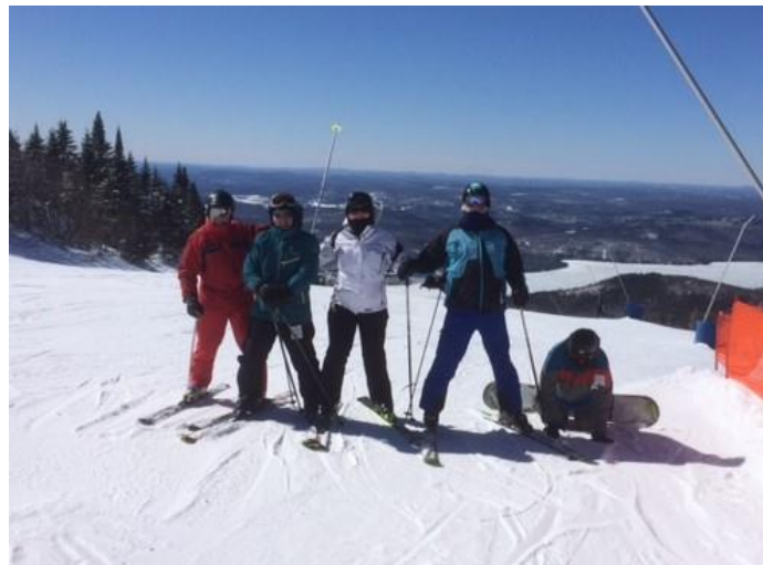
Mar. 18 – Tremblant DH bus – Tremblant skiers