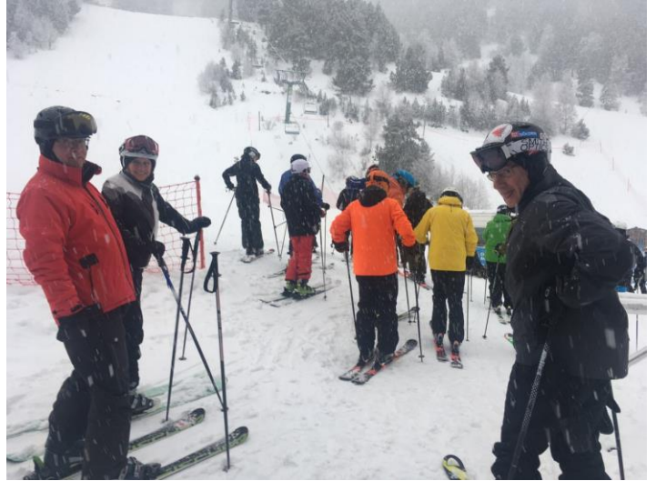
Jan. – Weeklong trip to Andorra