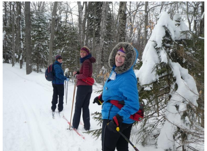
Enjoying snowy trails at Val David

Sunday saw everyone back outdoors before heading home.