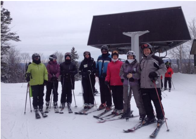
Bus trip to St-Sauveur

Oh wait, there's more.....two bus trips, one to Mont Tremblant/Mont Blanc on January 19th and the other to St-Sauveur on March 20th, aannd a three-day weekend trip to Mont Ste-Anne/Le Massif February 24th to 27th. Check the math.