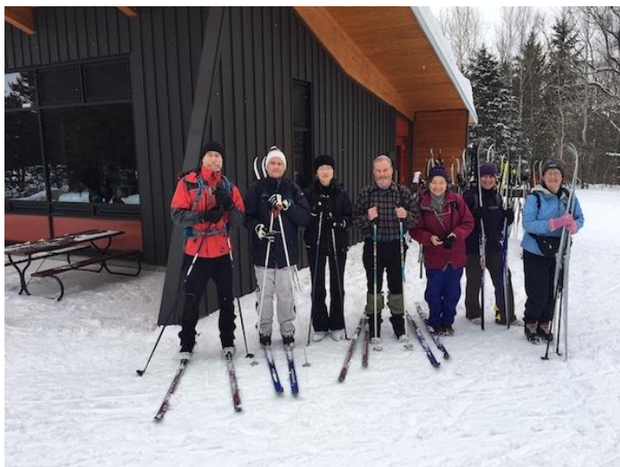
New Year's Day 2017 – At Renaud cabin