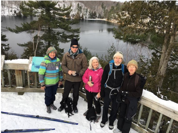
Dec. 11/16 – XC ski to Pink Lake

We are off to an excellent start for this season. Many of us were out skiing as early as November when we had our first snowfall and it only got better as we moved into December. So far, we are definitely making up for the slow start last year. For our 2016-17 season, we have plenty of interesting outings planned this year. To see the trip schedule, go to www.raski.ca and, on the left side of the page, click "X-Country".