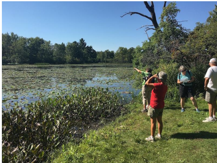
Sept. 6, 2016 – Hike to Mud Lake

This year we hiked 14 different trails in Gatineau Park including Wolf Trail and Lusk Falls. We also hiked Greenbelt trails, including Morris Island Conservation Area and Mud Lake. We had very popular urban hikes, including Beechwood Cemetery.