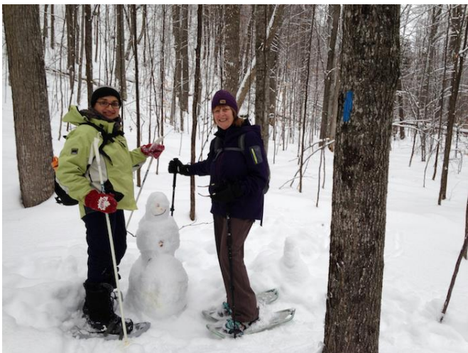
Jan. 2/16 Snowshoers and Frosty at Calabogie

Don't forget the bus trip to Tremblant on Jan. 19, where we can snowshoe at Domaine St-Bernard. And you can also still register for the Mont Ste-Anne weekend trip where the snowshoeing is absolutely wonderful. All the planned outings are on the web, and I may add a few more, depending on weather conditions and if anyone wants to organize one. So keep checking the website and the SnowPhone for last minute changes. I look forward to snowshoeing with you!