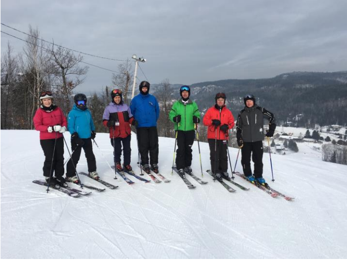
DH Meet'n'Ski at Edelweiss