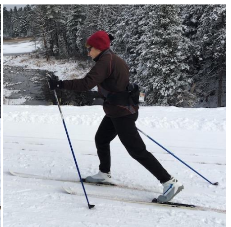
RA cross-country skiers