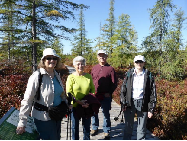
Oct. 4/16 – Hike at Mer Bleu