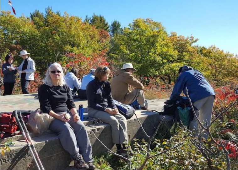
Oct. 10/16 – Hike to Lusk Falls