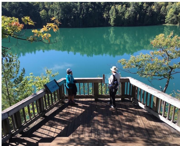
Sept. 27, 2016 – Hike to Pink Lake

We offer hikes on weekdays and weekends, at various levels of difficulty, and are always looking for leaders. You can meet us at the RA to carpool, or go straight to the trailhead if you let the leader know in advance. Hikes are followed by optional excursions for coffee, ice cream or casual lunches.