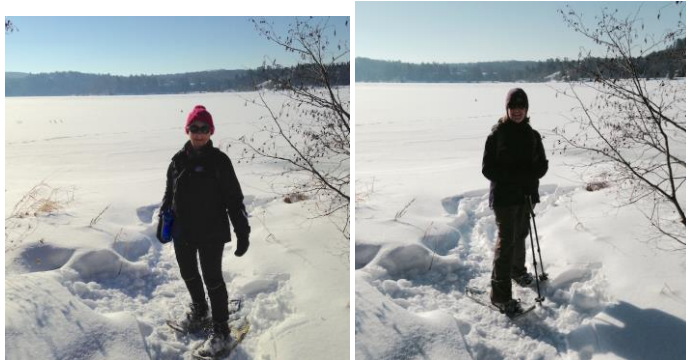
Jan. 2/17 – Snowshoeing at Calabogie

At last we have snow and we've just enjoyed our first outing to Cascades on January 2nd. There are lots more outings planned for the rest of the winter so come on out and join us! There are mid-week outings and several weekend ones to accommodate people who work during the week. We have some to places we haven't done before such as Larose Forest, Morris Island near Fitzroy, and one in the Greenbelt just off Corkstown Road near Wesley Clover Park.