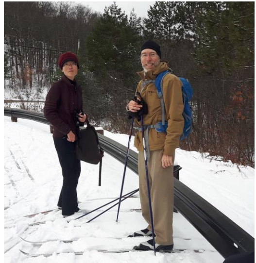
Nov. 28/16 First XC ski of the season, P8 to P9