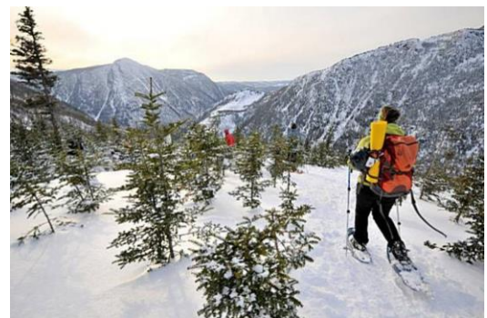
Snowshoeing at Le Massif

SNOWSHOEING: 67 km of trails at Mont Ste-Anne, and 31 trails at Le Massif