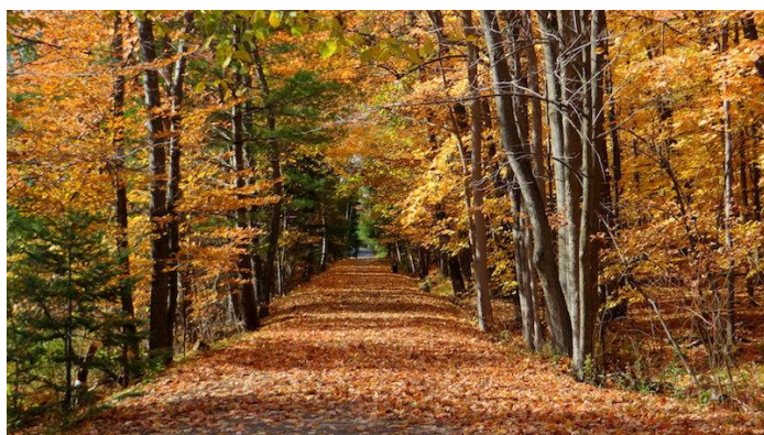
Oct. 26, 2016 – Morris Island hike

RASki hikes are a great way to get fit for winter skiing and snowshoeing, and a fun way to stay fit in the spring when the snow's gone and the bicycling has yet to begin.