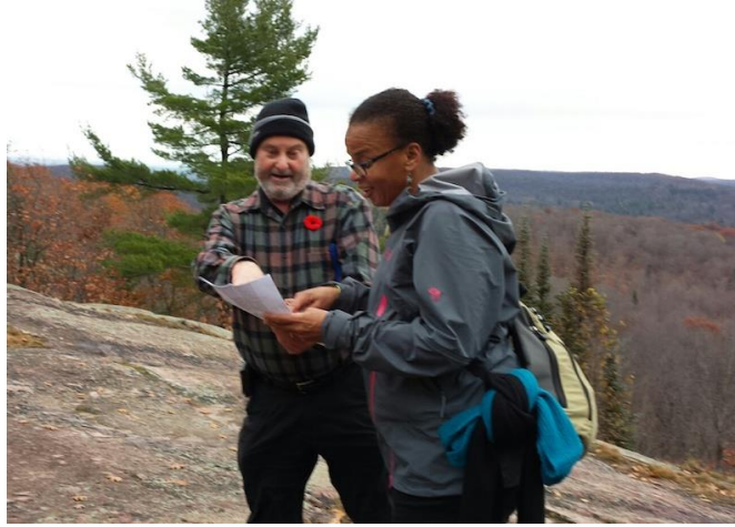
Nov. 5/16 - Wolfe Trail hike