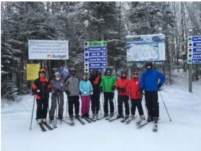
Jan. 2016 St-Sauveur - Group photo

Our mid-week bus trip to Mont St-Sauveur took place on January 15th and we enjoyed very good ski conditions. Twenty-seven downhill skiers, two cross country skiers, and two Getaway enthusiasts registered, for a total of thirty-two registrants. This was the first time that cross country skiers joined the trip and we will include that option in the future. Once all of the expenses, including the RA fee were paid, we made a surplus of just over $90.