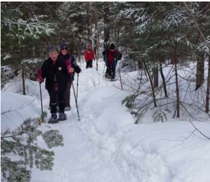
Snowshoeing at Val David weekend

We also had a guided snowshoe outing in France during the weeklong trip to Les Trois Vallees which was very enjoyable and informative. And there were two outings in the Val David area also in February during our weekend trip to L'Auberge. The first day of these was somewhat spoiled by rain which started around mid-morning but the next day was beautiful and we had a record number of participants to enjoy it.