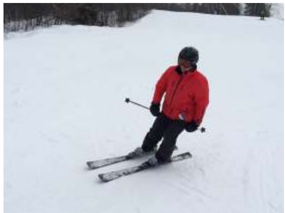
RA skier at Edelweiss

Our Facebook page has become an important communication tool to compliment our website, in particular for those who use Facebook regularly and who, perhaps, use the RASKI website less frequently. I am able to see how many people look at each posting, which gives a clear indication of the regular following. All of our club activities draw significant interest and I have received feedback that people like to read about the DH, XC and Snowshoe locations that have good, or not-so-good conditions. This page has also drawn a number of non-members, and some have written to ask about our club and about coming on our downhill and cross country outings. I would recommend that all club activities utilize this publication opportunity to promote their outings.