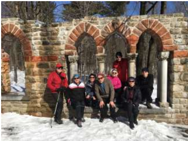
Mar. 26/16: RA Ski biathlon - 800 m hike