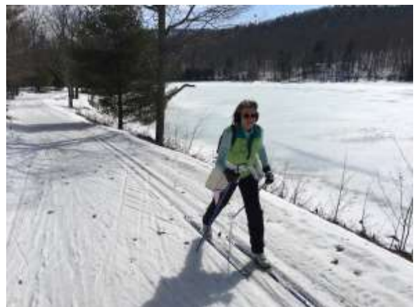
Mar. 12/16 – XC ski around Taylor Lake

Your XC co-chairs would like to extend a very special thank you to the people who led trips this year. To put it quite simply, without these generous volunteers, we would not have a XC program. If you haven't volunteered in the past, you might want to consider this for next year. Speaking from experience, it is a very satisfying and rewarding opportunity and the more leaders we have, the better.