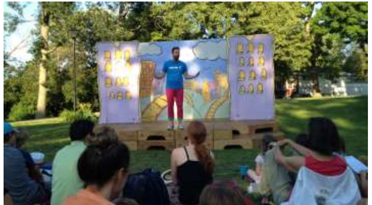
July 2016 – Company of Fools outdoor theatre

In July, join us for some outdoor theatre with the Company of Fools in a local park. This summer's production is Shakespeare's "The Amazing Adventures of Pericles, Prince of Tyre". Check our web site and SnowPhone later for all the details.