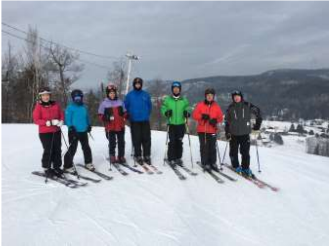
Jan. 25 – Meet'n'ski to Edelweiss

Despite the El Niño effects, the mid week Meet'n'Skis drew hearty skiers who enjoyed the company of other like-minded enthusiasts.