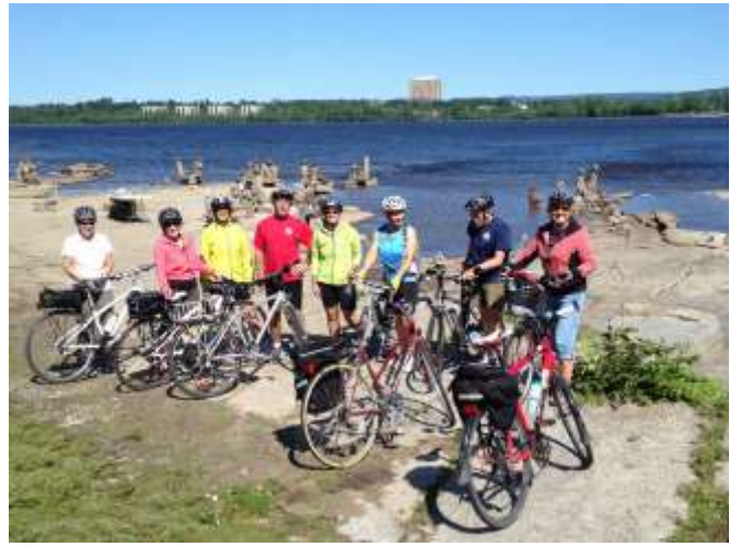
July 2015 – Cycling to Brasseurs du Temps pub