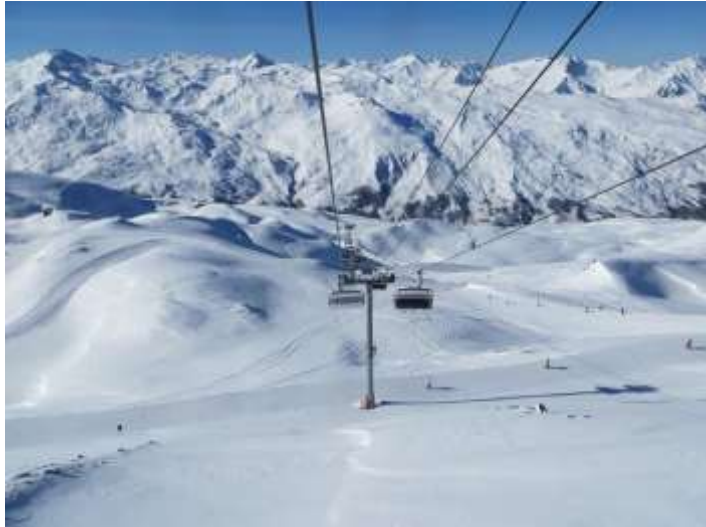
Lift at Trois Vallées

The 2016 RASki Weeklong excursion drew participants from far and wide, making it the largest group in decades. Family, friends, and new members from around the region (Ottawa, Gatineau, Orléans, Nepean, Kanata, Manotick, Greely, Osgoode), the province (Westport, Perth, Belleville, Trenton, Thunder Bay) and other provinces (Montréal QC, Calgary AB, and Vancouver BC) joined us this year.