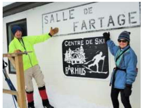
Feb. 2016 – XC skiing at Val David

Overnight it snowed about 15 cm, and the morning saw everyone head out to the various locations for their activities. Although the trails were closed down in the afternoon due to the weather, everyone found something to do after that such as more shopping, sightseeing, reading or the outdoor hot tub. We spent the evening enjoying a four course meal again, with lots of discussions around the table, with particular interest in the latest of Downton Abbey! Sunday morning was a great ski and snowshoe with some sunny skies. Doris reached a milestone that day leading the largest group of RA snowshoers at an outing - nine in total! All in all a very enjoyable weekend.