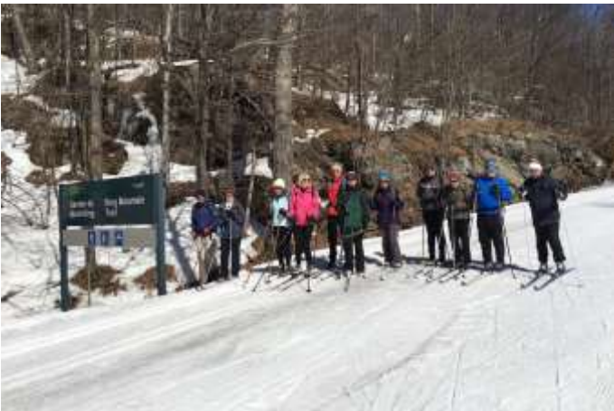
Mar. 19/16 – XC ski to King Mountain

Both weekend day trips and weekday trips were well attended this year. A few trips had to be cancelled or rerouted for rain or lack of snow but, generally, trips went as planned.