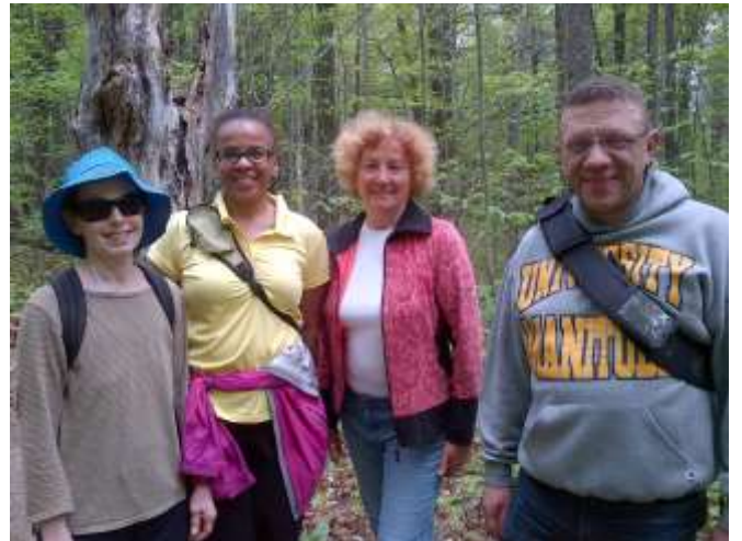
May 2015 – Hike to Keogan