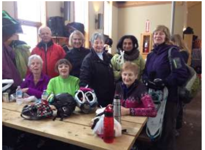
Jan. 2016 – RA downhillers & snowshoers at Calabogie