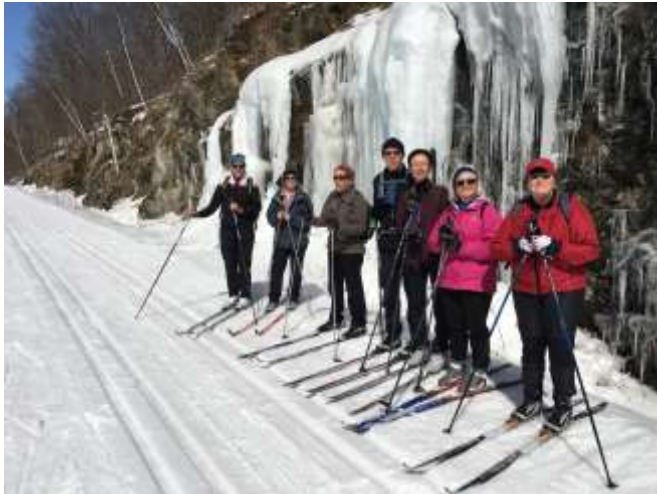
Mar. 26/16: RA Ski biathlon - 9.5 km XC ski