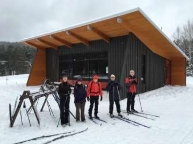
New Year's Day ski to the new Renaud cabin

What a change from last year!! From subarctic temperatures in 2014-15 to a late start followed by rain and mild temperatures in 2015-16. Although many of us haven't skied as many times as last year, the experience when we did ski has been much more pleasant than skiing in -30 ° weather. The few snowfalls we've had were followed by several days of superb skiing. Already many of us are enjoying some early spring skiing under brilliant sunny skies.