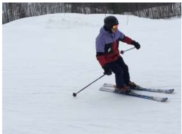
Another RA skier at Edelweiss