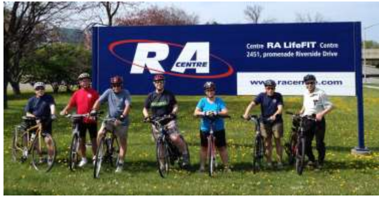
May 18/15 - Cycling to Dow's Lake