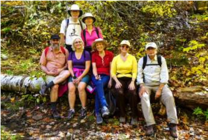
Oct. 2015 – Hike to Lusk Falls