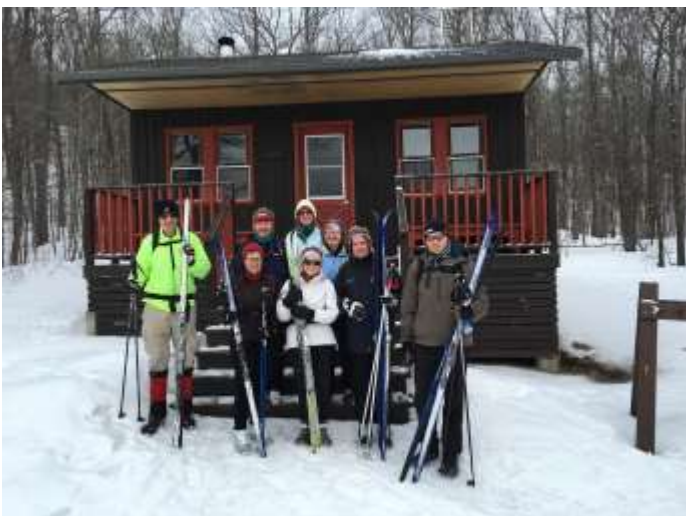
Feb. 6/16 – Lusk cabin

Unfortunately, we had to cancel our 2 outings this year outside of Gatineau Park – la Petite Rouge due to lack of interest and Nakkertok due to rain. We would like to continue to include one or two outings outside of Gatineau Park each season. Please let us know where you would like to ski.