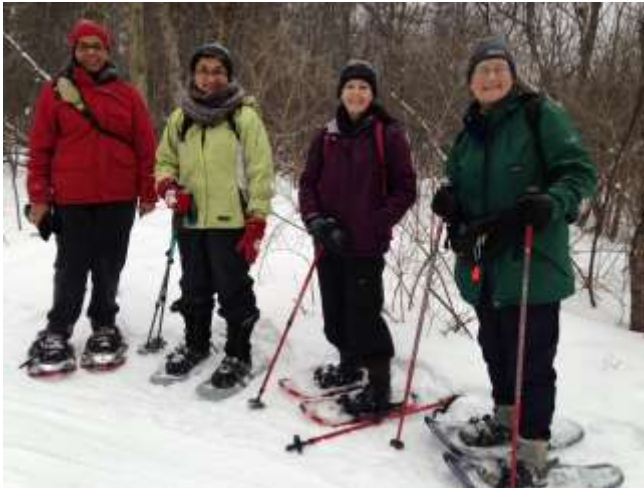
Jan. 16/16 Pinegrove forest

We snowshoed at Calabogie to begin our season in early January and although we had only had one snowstorm, the trail was beautiful. We had several outings in the Greenbelt both in the west end of the city and the east end, including a moonlight outing in February with the cross-country skiers.