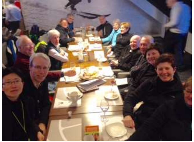
Jan. 25/16 - T-Bar 70 at St. Sauveur

for the return bus and arranged for a private room upstairs in the bar. That gave all participants the opportunity to gather together and share stories from their day. Most participants preferred this option and feedback was very positive.