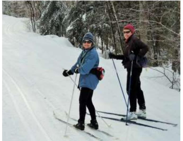
Feb./16 – XC skiing at Val David

afternoon, while others had a leisurely lunch or did some shopping in town. After a complimentary drink at the bar, we enjoyed a gourmet four course meal at the Auberge with many choices to choose from.