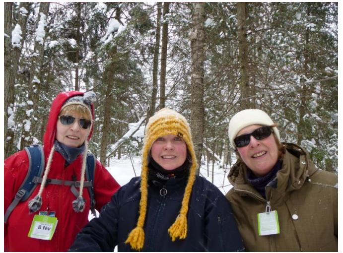
Feb. 2015 – Snowshoers at Mont Tremblant

There were 15 participants on our Mont Tremblant trip in February this year, enjoying excellent conditions for cross-country skiing and snow-shoeing. This was our first time staying at le Grand Lodge and it was delightful. We had great meals and quiet accommodation. We gathered each evening in front of the large fireplace before dining in our private dining room. During our Friday dinner, we all played a wonderful game of Ski Trivia that two of our members put together. Even though it was cold, the XC trails were well-groomed with no ice. The snowshoeing was also very good according to the groups who snowshoed each day. We plan to return to either Val David or Mont Tremblant next year.