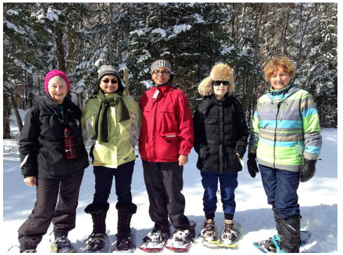
March 2015 – Snowshoers at Domaine St-Bernard