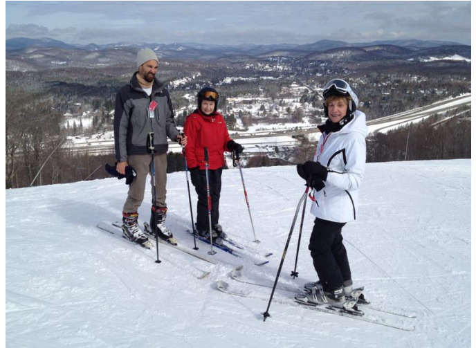
Mar. 16/15 – RA skiers at Mont Blanc