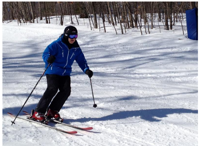
Mar. 2015 – RA skier at Vorlage