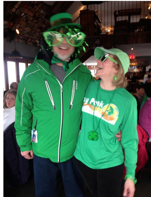
Winners of the St. Paddy's Day contest on the bus to Tremblant