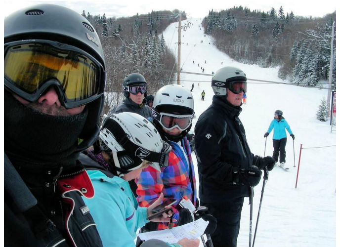
Mar. 16 – RA skiers at Tremblant