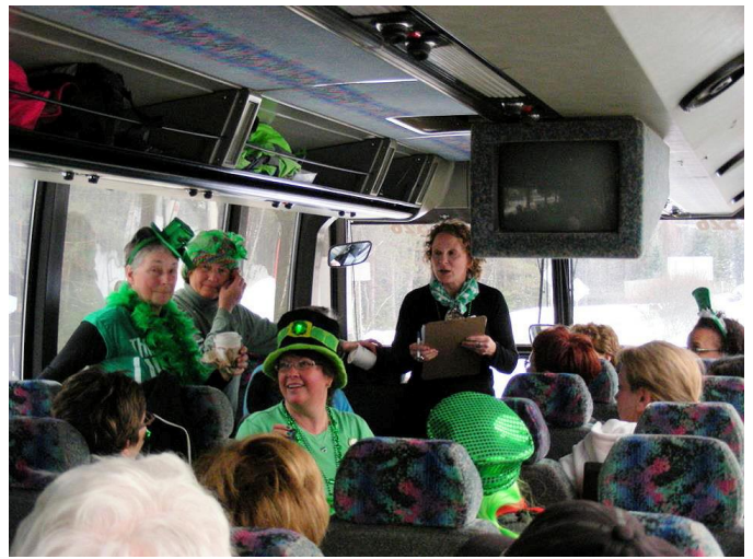
Mar. 16 – Our trip leader on the bus to Tremblant