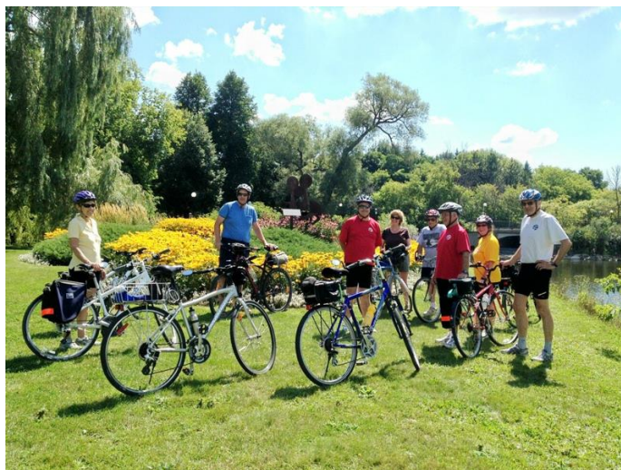
Aug. 2014 – Cycling to Lac Leamy