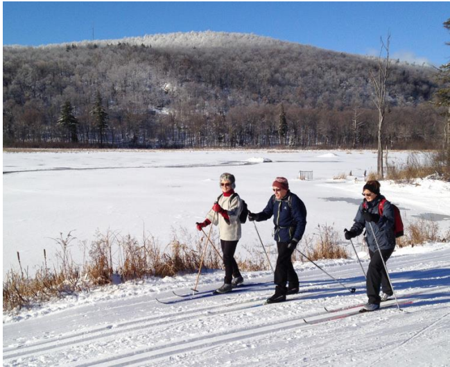
Dec. 2014 - XC ski from P9 to P5