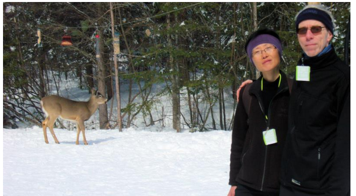
Mar. 2015 – XC skiing with a deer at Domaine St-Bernard