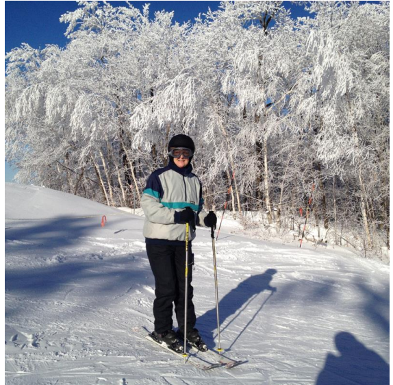
Dec. 2014 – RA skier at Mont Ste-Marie