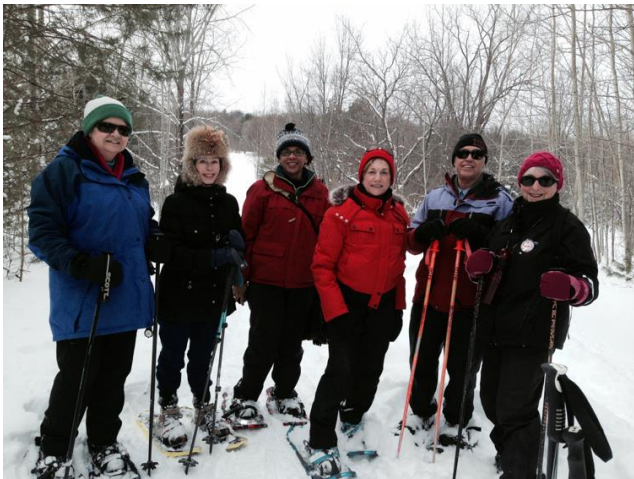
Feb. 2015 – RA snowshoers at Bruce Pit