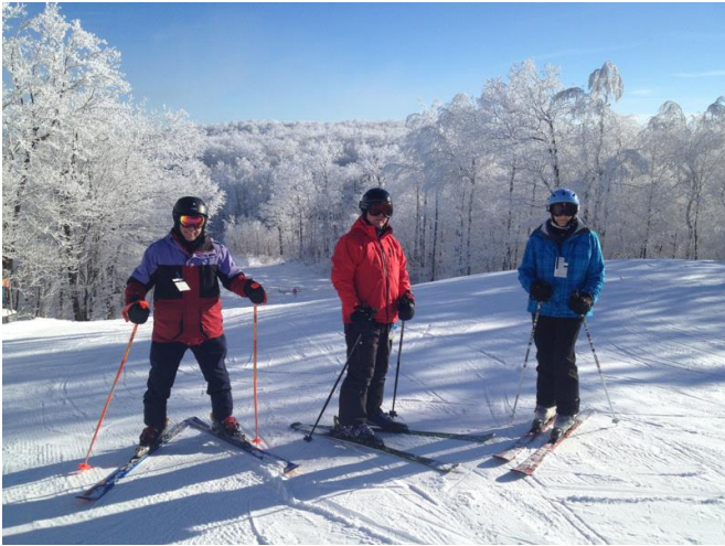
Dec. 19/14 – DH Meet'n'Ski at Mont Ste-Marie

Despite the chill, the twenty mid-week Meet 'n' Skis drew hearty skiers, and numbers were a little higher overall than last winter. We could rarely identify who we were skiing with because of the face masks, worn to combat frost bite! Skiers who braved the elements were surprised and delighted by the typically excellent snow conditions and the pleasant company. Many thanks to our trip leaders who kept track of our skiers and ensured that everyone was included, both on the hill and during our lunch breaks.