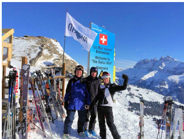
Jan./15 – RA skiers at border with Switzerland