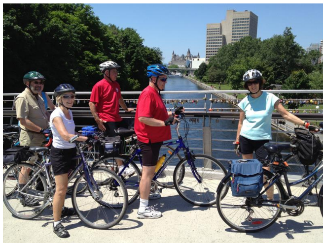
July 2014 – Cycling to Parc Mousette

We are still lining up more hikes and bike rides for the spring and summer. There will be more cycling and hiking in the fall and we may add other summer events as they come up.