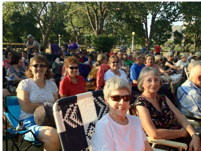
Theatre-in-the-Park – Watching a play by The Company of Fools

In August, we will see Odyssey's Theatre's annual Theatre Under the Stars. They haven't announced their play yet, so check our SnowPhone and website later for details.