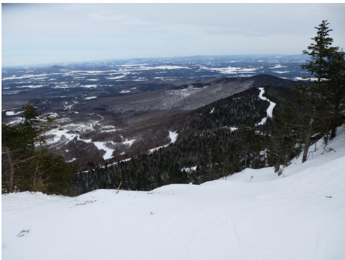
View from the top of Jay Peak

During our stay, we found everyone to be extremely friendly, lifties, ski hosts, resort workers, shuttle drivers, restaurants and stores staff. You could ask questions of anyone wearing Jay insignia or for directions and most of them would even walk you there!