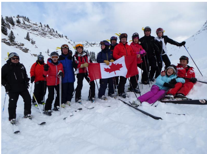
Jan. 2015 - RA skiers at Morzine, France

And so began the RA Ski Club Weeklong Trip (2015) to Morzine France. As hoped for, there was plenty of snow on the ground when we arrived at our hotel, no matter that it had only fallen the day before. The mountains however had plenty of snow and with this fresh layer sparkling beneath our skis, a bright blue sunny sky above, and crisp dry air at -5C, we were in skiing heaven. Even those who hadn't been skiing till now found themselves letting loose in mid-season form right off the bat. Our elation was practically euphoric with everything being so perfect.