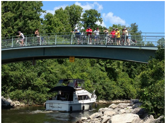
Aug. 2014 – Cycling at Lac Leamy