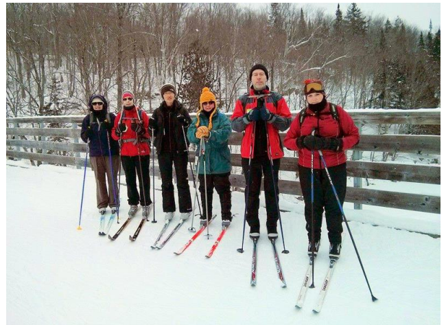
Feb. 2015 – XC skiers on Tremblant weekend

Your XC co-chairs would like to extend a very special thank you to the people who led trips this year. To put it quite simply, without these generous volunteers, we would not have a XC program. If you haven't volunteered in the past, you might want to consider this for next year. Speaking from experience, it is a very satisfying and rewarding opportunity and the more leaders we have, the better.