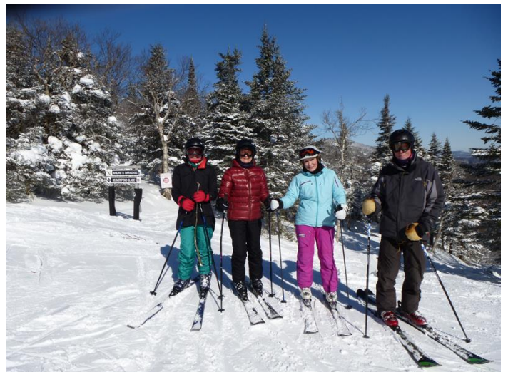
Four RA skiers at Jay Peak

The gusty wind did cause our intrepid snowshoers to change their plans one morning when they tried to make their way across the base to the trailhead, but fought the winds the entire way, never making the shelter of the treed trails.