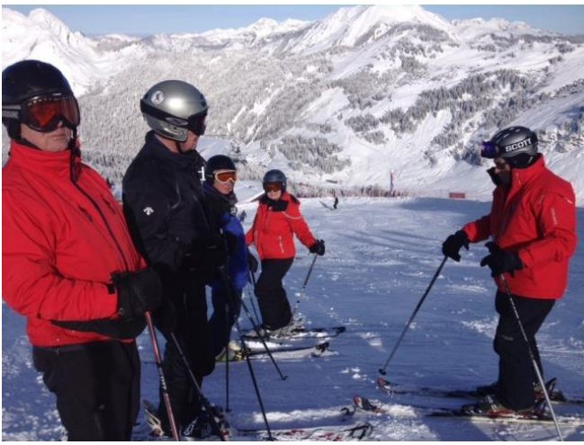
Jan. 2015 – RA Skiers at Morzine, France