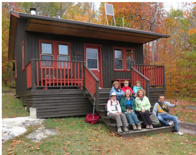
Oct. 2014 – Hike to Lusk Lake