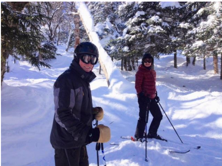
Skiing in the powder at Jay