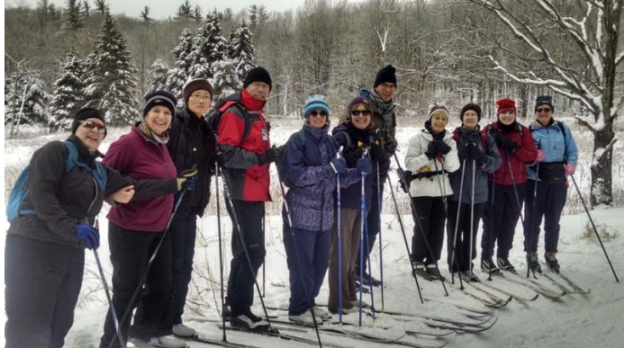
Jan. 2015 – P17 Wakefield to Lac Philippe

Both weekend day trips and weekday trips were well attended this year. A few trips had to be cancelled or rerouted for lack of snow or poor conditions, but generally trips went as planned.