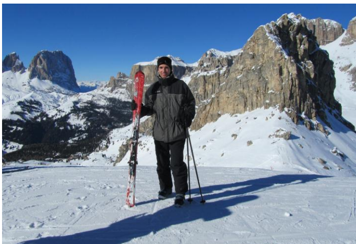
Skiing at Val Gardena, Italy