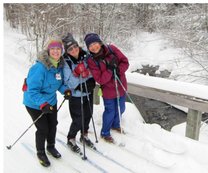
XC ski to Lusk Lake, 6 March