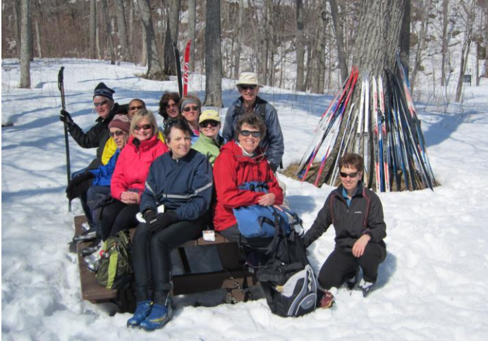
XC skiers at King Mountain, 20 March

After a slow start to the ski season, a couple of big snowfalls in February and early March allowed for some memorable trips in Gatineau Park. Unfortunately, the freaky March weather, consisting of snow followed by rain, wreaked havoc on the later part of the schedule.