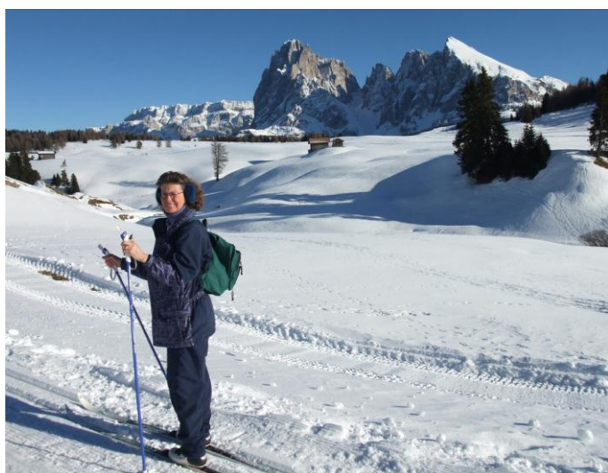
Cross-country skiing at Val Gardena

As was expected, the overnight trip to Ortisei was exhausting. The return trip was much more pleasant than the outbound trip. We left the hotels around 9:45 am and arrived at our Venice airport hotel about 2:00 pm, so most took advantage of the free afternoon and evening to visit the old city of Venice for a walking tour and dinner. The morning flight Sunday enabled us to leave at a reasonable time and do the trip in a single day. Several of the group members have been kind enough to pass on their thanks for a great experience.