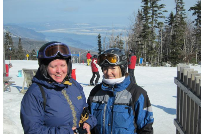
RA skiers at Le Massif

On Saturday after skiing, some of us went into Quebec City for dinner, and a few of us hitched a ride with them to a local restaurant - the St. Bernard. We liked the food there so much that we got the bus driver to take us there again the next night.