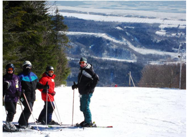
Skiing at Mont Sainte-Anne

The hotel rooms were well equipped and roomy. The hotel had a restaurant and a bar where we could get food. There were two outside hot tubs and an indoor swimming pool and hot tub. Cross-country skied Park Mont Sainte-Anne and the downhillers skied Mont Sainte-Anne Saturday and Monday, and Le Massif Sunday. Some of the runs were icy Saturday, but those who persevered found runs that were not icy and retired to the outdoor hot tub to meet the others. The skiing was good Sunday and Monday.