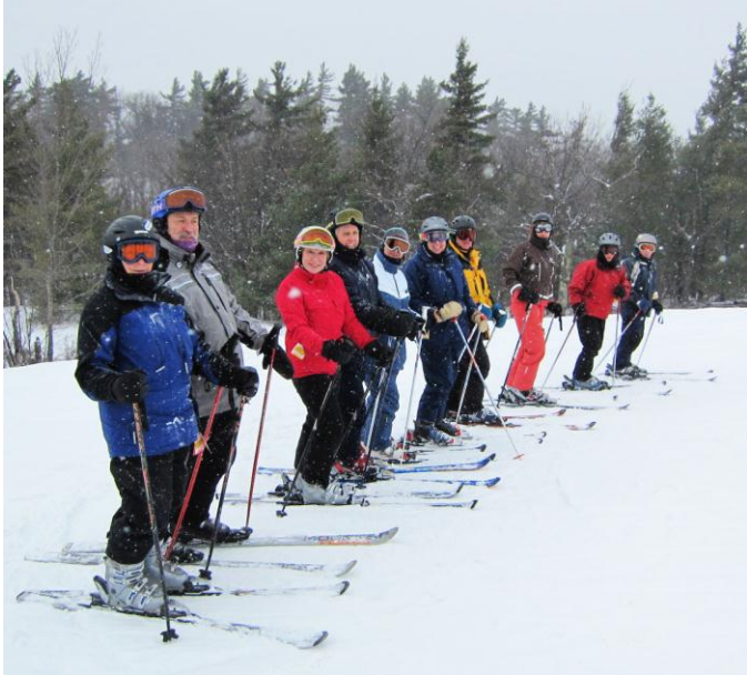
Meet'n'Ski at Calabogie, 7 January

Our mid-week meet 'n' skis were well attended. Early in the season we had to cancel the first two due to lack of snow, but as the season got rolling there were usually 6-8 people attending most events. Fifteen people enjoyed perfect ski conditions at our meet'n'ski to Calabogie in January. We did move some mid-week meet'n'skis due to weather, and changed location a couple of times to take advantage of special $10 days and a $1 day at Mont St Marie. By popular demand we added another three weeks of meet'n'skis at the end of the season.